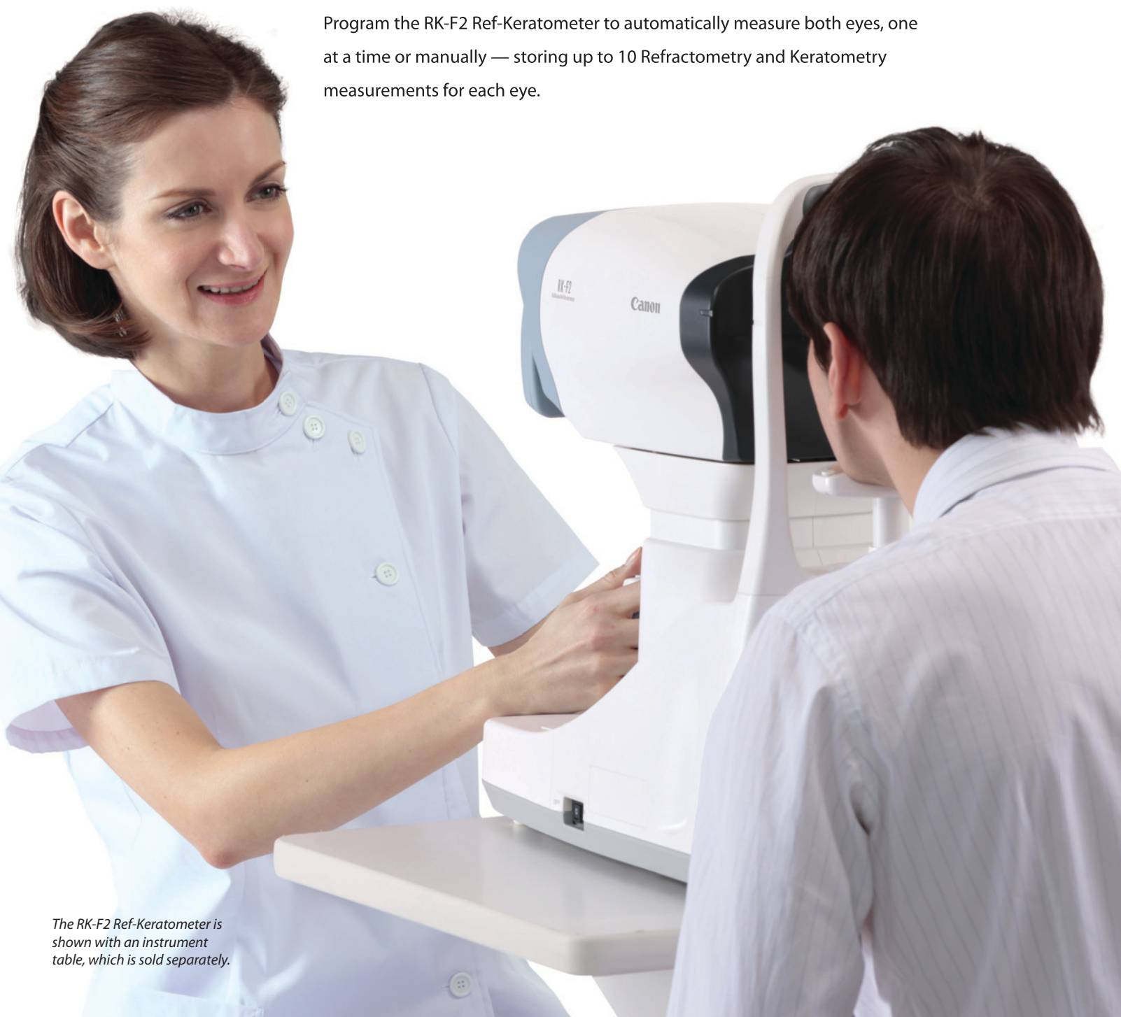
The RK-F2 Ref-Keratometer is shown with an instrument table, which is sold separately.

Program the RK-F2 Ref-Keratometer to automatically measure both eyes, one at a time or manually — storing up to 10 Refractometry and Keratometry measurements for each eye.