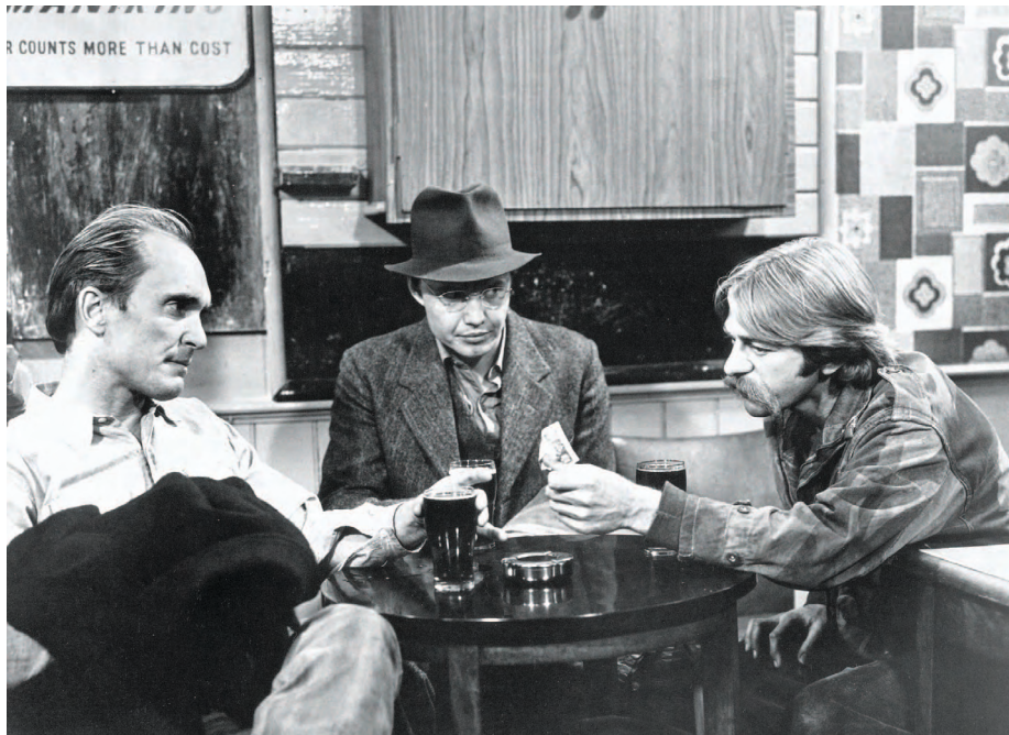
In The Revolutionary , A (Jon Voight) is pulled between two forces—the Old Leftist Despard (Robert Duvall, left) and New Leftist Leonard II (Seymour Cassel).