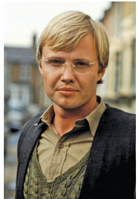
Jon Voight as the idealistic and rebellious young student A in The Revolutionary .