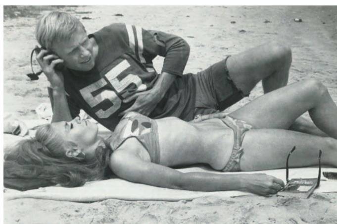
Russ Jon Voight) and Christine Lada Edmund Jr.) enjoy Long Island beach life in Paul Williams's debut feature film, Out of It 1969).