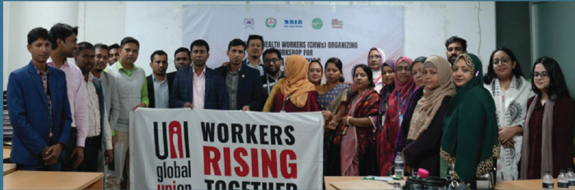
Glimpse of Community Health Workers (CHWs) Organizing Workshop for BFPIA and BFWAA

On 15 December 2025 in Dhaka, a workshop was held focusing on organizing Community Health Workers (CHWs) affiliated with BFPIA and BFWAA. The session emphasized strengthening collective organization, shared advocacy, and solidarity among community health workers, highlighting their critical role in delivering care and advancing labor rights, dignity, and recognition within Bangladesh's health and care systems.