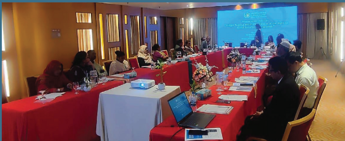
Sapran's Participation on OHCHR Dissemination Event on Social Security Rights in Bangladesh

On December 2, the United Nations OHCHR Mission in Bangladesh hosted a dissemination event on its study titled “Budget Tagging and the Realisation of the Right to Social Security in Bangladesh” at the Six Seasons Hotel in Gulshan, Dhaka.