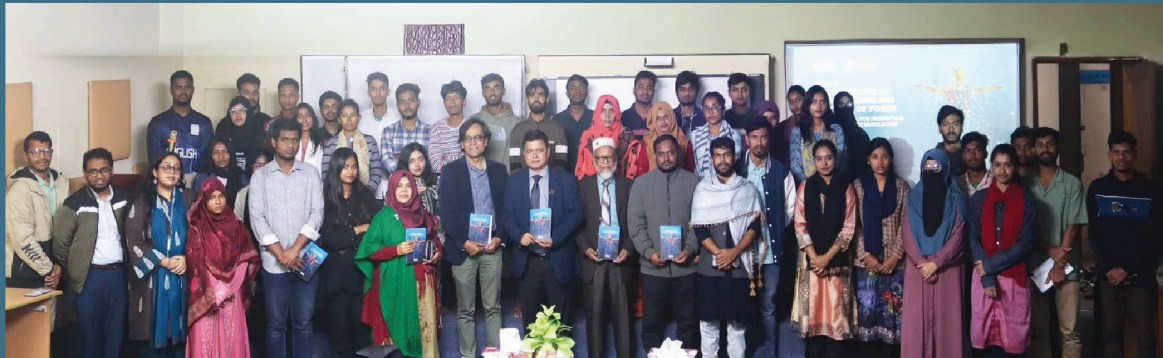
Seminar on "The Lethality of Chhorra Guli and State Use of Force"

An Urgent Call for Prohibition of Pellet Guns in Bangladesh