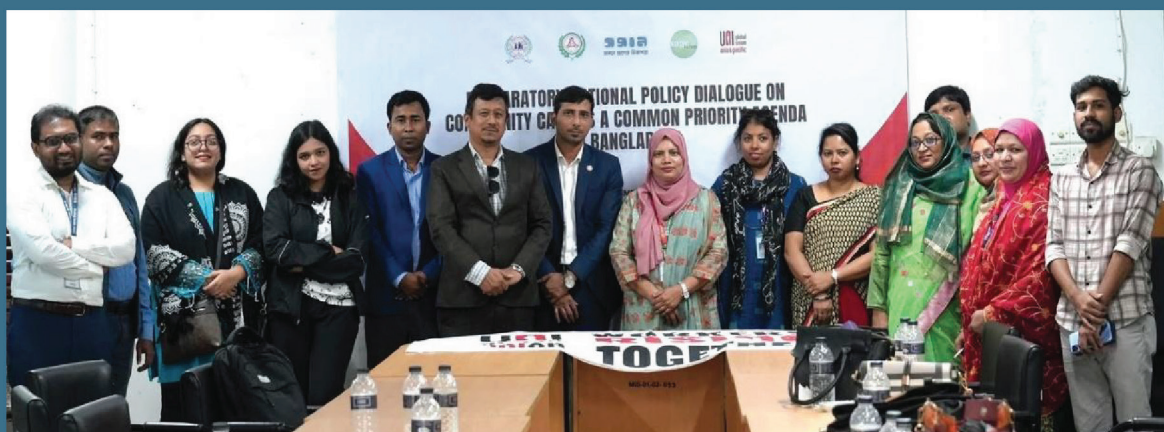
Glimpse of Preparatory National Policy Dialogue on Community Care as a Common Priority Agenda in Bangladesh