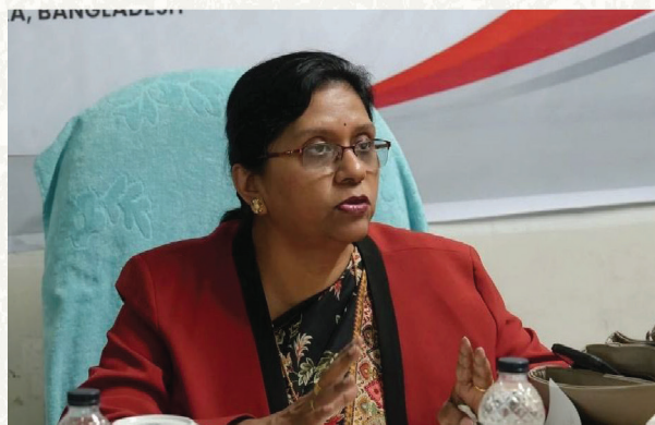
DG of Department of Family Planning

On 18 December 2025 in Dhaka, a Preparatory National Policy Dialogue was held to advance community care as a shared national priority in Bangladesh. The dialogue brought together key stakeholders to reflect on care as a critical social, economic, and human rights issue, emphasizing collective responsibility, policy coherence, and inclusive frameworks that recognize care work as central to social protection, dignity, and sustainable development.