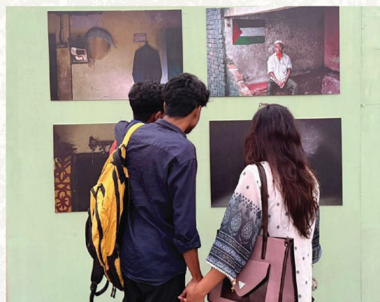
Glimpses of exhibition on Resistance of Memory

Through visual storytelling, it highlighted memory as a form of resistance—challenging erasure, impunity, and state produced narratives, while centering the enduring suffering of victims and their families. The exhibition reinforced Sapran’s commitment to human rights, collective memory, and dignity as essential foundations for justice and accountability.