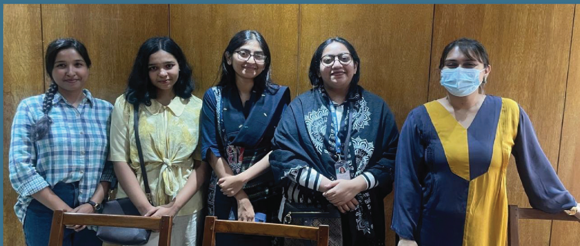
Collaboration Between Sapran and The Blast Shonghoti Team

Bangladesh continues to experience recurring patterns of violence linked to political instability and targeted attacks on vulnerable communities, particularly in the aftermath of the 2024 Monsoon Uprising, which exposed the scale of state violence and the fragility of institutions weakened by long term politicisation. Drawing on Sapran’s research on pellet-gun injuries, headshot killings, and the evolving transitional human rights landscape, alongside BLAST’s extensive field-based legal work with affected and minority communities, the discussion underscored shared concerns about institutional breakdown, denial, and impunity during post-uprising recovery. Recognizing their complementary strengths—BLAST’s legal expertise, field documentation, and community engagement, and Sapran’s multidisciplinary analysis and human rights investigations—the two organizations agreed to pursue a joint initiative to examine post-uprising violence, minority victimization, and institutional vulnerabilities. This collaboration aims to develop shared documentation frameworks, conduct joint research, produce a co-authored analytical report, and disseminate findings through coordinated advocacy and dialogue to strengthen public understanding, accountability, and institutional resilience in fragile post-uprising contexts.