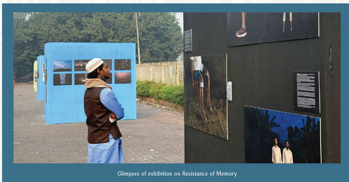
Glimpses of exhibition on Resistance of Memory