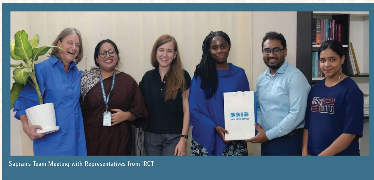
Sapran's Team Meeting with Representatives from IRCT