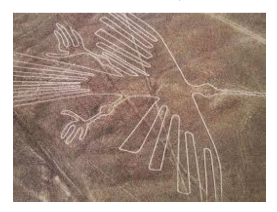
Nazca Lines from the Air

You will be picked up from your Hotel in Lima at 6:00 am, we will provide a driver and a minivan, the ride will take around 6 hours each way. On the way we will visit the Museum of the site. The Maria Reiche tomb and we will stop at the Over view of Nazca. Cut into the stony desert are large number of lines, not only parallels and geometrical figures, but also designs such as a dog, an enormous monkey, a bird with a wing span of over 100 meters, a spider and a tree. The lines, that represent some sort of vast astronomical pre-Inca calendar, are best seen from the air, we will take a half hour flight above the Lines (Airfare included), after the over flight we will take some time to rest and we will have lunch (included) before to come back to Lima. Upon arrival transfer to your Hotel. (L)