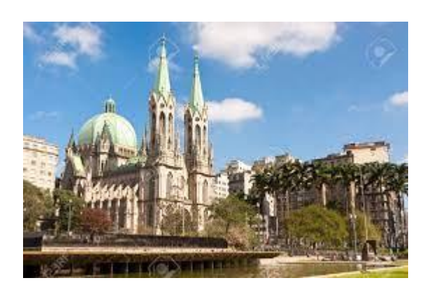
Cathedral of Sao Paolo