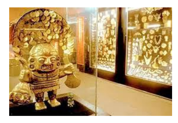
Gold Museum Lima