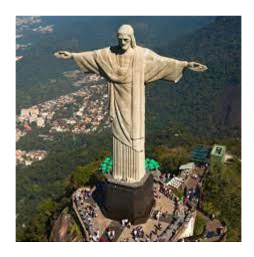
Christ Redeemer Statue – A Wonder of the World

Thu, Jul 2nd – Rio de Janeiro (dep 10:40AM) to Iguassu Falls, IGU, (arr 12:50PM) by TAM Brazilian Airlines – 3153. Sightseeing of Iguassu Falls - Argentina side. Stay overnight at Iguassu Falls.