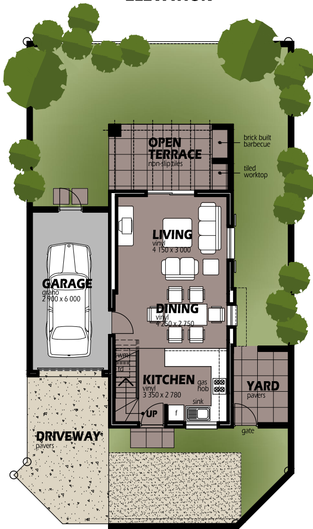
GROUND FLOOR LAYOUT