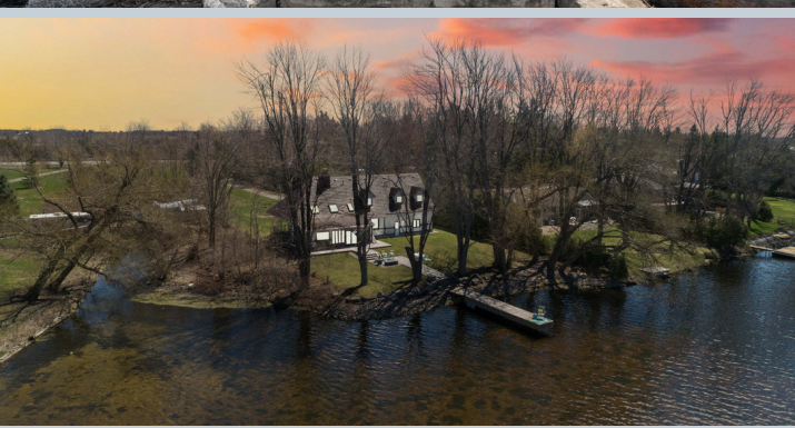
Information is for marketing purposes ONLY and should be verified.