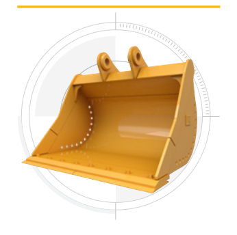
DITCH CLEANING BUCKETS