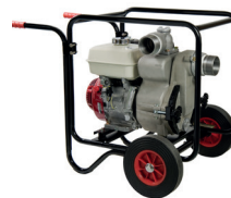
TED2-80HA with trolley