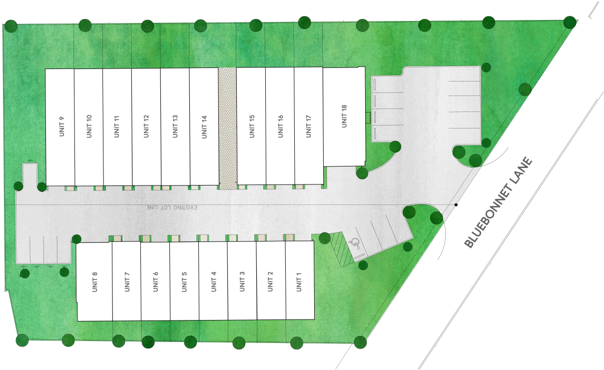
Artist rendering only. Actual colors and plans may vary significantly.