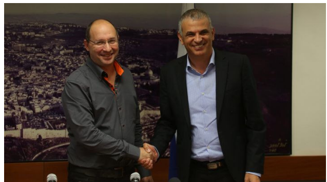
Israel's Labor Federation, Finance Ministry Avert Nationwide Strike in 'Historic Agreement'