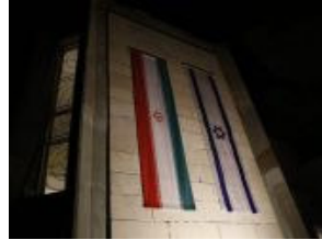
Iranian 'Embassy' Opens in Jerusalem, Without a Diplomat in Sight