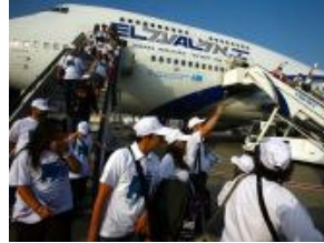
An Immigrant's Answer to Amira Hass: We Are Not Criminals