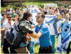
Fascism in Israel: Stand Up Now, or Be Put Down Later