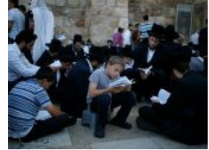
Israel, on the Road to a Theocracy