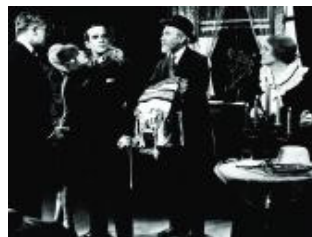
This Day in Jewish History, 1927 // Alleged First Talkie, Al Jolson ...