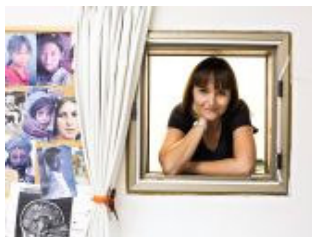
What Do We See When We Look at Someone's Face?