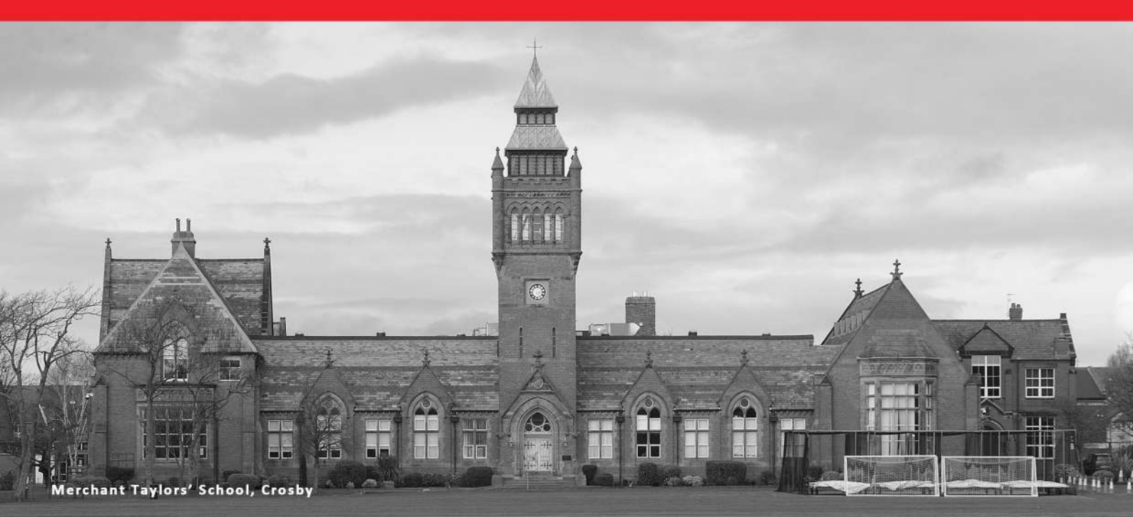
Merchant Taylors' School, Crosby