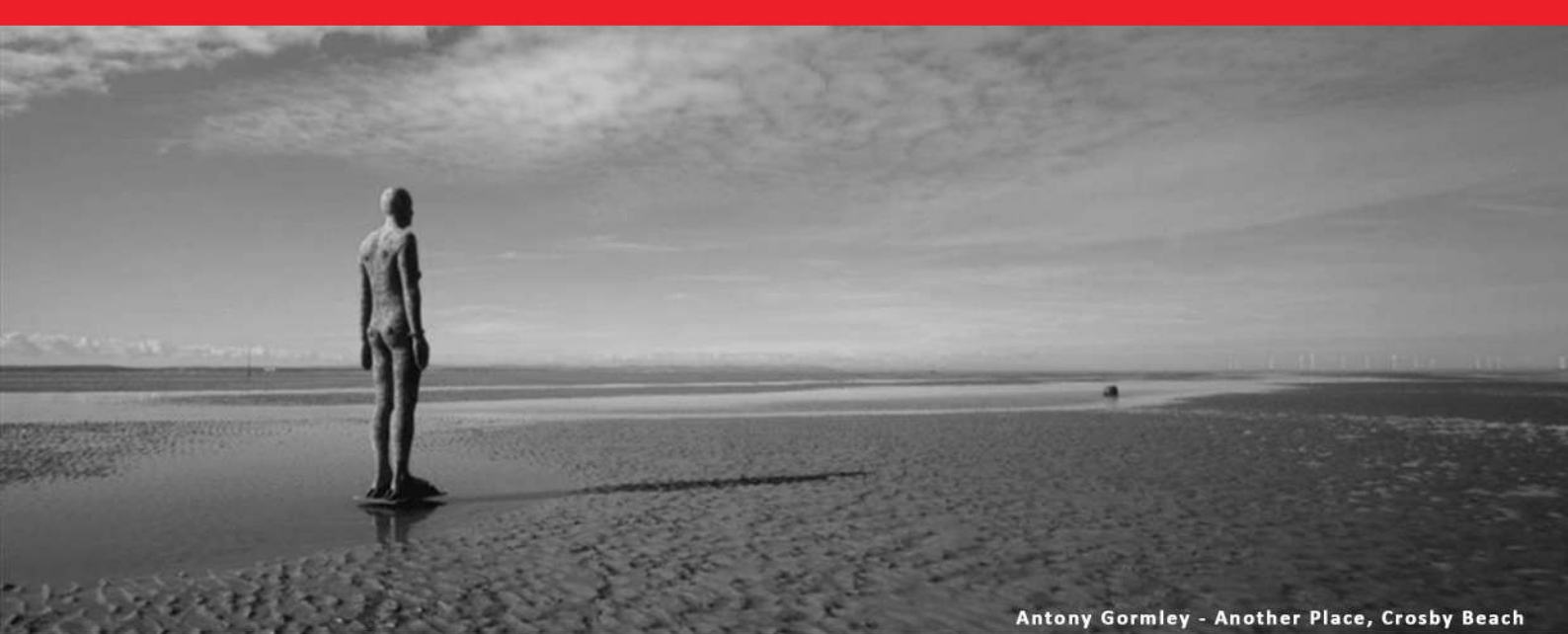
Antony Gormley - Another Place, Crosby Beach