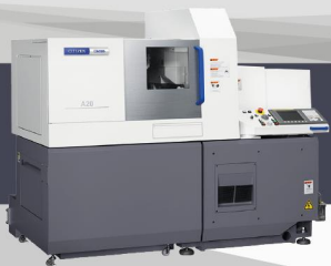
Swiss type turning