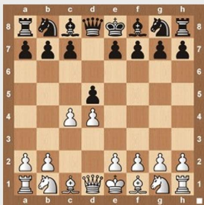
Here's a diagram showing the opening

The Queen's Gambit, in the game of chess, is an old yet aggressive opening that tries to gain the upper hand by sacrificing a pawn (hence the term 'gambit'). The opening starts with d4 followed by d5 and then c4 (note that in every chess match, the player with the white pieces is the first to make a move). Black can choose to take the c-pawn, however, this will put him at a disadvantage – which is why, more often than not, the position turns into one of many variations of the 'Queen's Gambit Declined'.