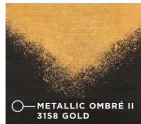
— METALLIC OMBRÉ II 3158 GOLD