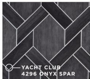
— YACHT CLUB 4296 ONYX SPAR