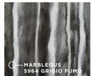
— MARBLEOUS 5964 GRIGIO FUMO