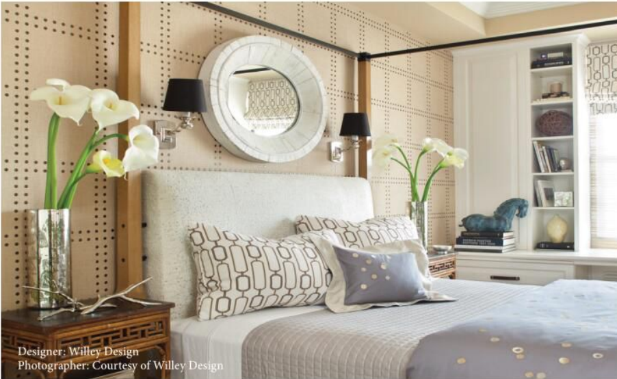
Designer: Willey Design