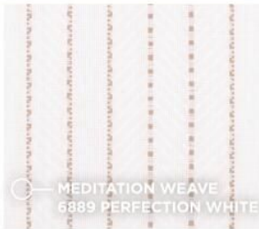
— MEDITATION WEAVE 6889 PERFECTION WHITE