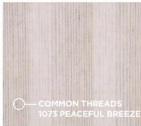
— COMMON THREADS 1073 PEACEFUL BREEZE