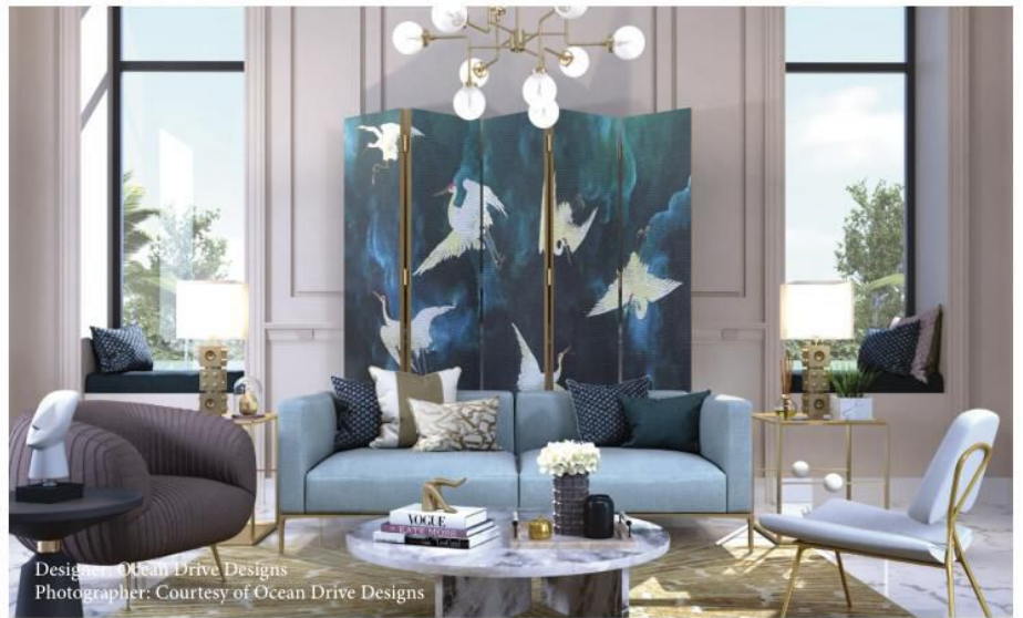
Designer: Ocean Drive Designs

Sophisticated and glamorous, luxe interiors are the haute couture of the design world. From the court of Versailles to the golden age of Hollywood, sumptuous interiors have captivated and inspired us for centuries. Today's luxe designs share the same pursuit of quality and elegance—with a little fantasy thrown in. Even as our offices become more casual and our lifestyles less formal, a luxe interior holds on to its sophisticated roots.