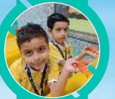
TABLE MANNERS ACTIVITY

To inculcate spirituality & gratitude in children Ganesh Chaturthi was celebrated with zeal and enthusiasm. A prayer with rituals was performed in front of children and stories of Lord Ganesh were told and they did craft and dabbing activity which were related to Ganesh.