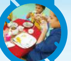
Table Manners activity was conducted for the students of KG to inculcate good eating habits & etiquettes. All the students followed their teachers' instructions who demonstrated them how to sit while having meals, set the cutlery on the table, use napkin, chew food properly and then winding up the things.