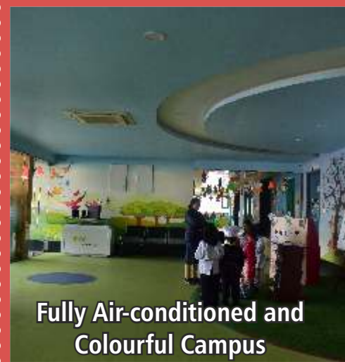
Fully Air-conditioned and Colourful Campus