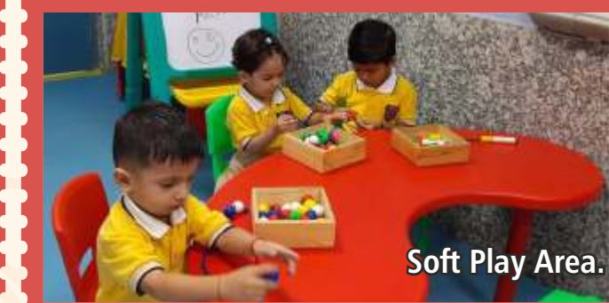
Soft Play Area.