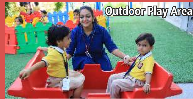
Outdoor Play Area