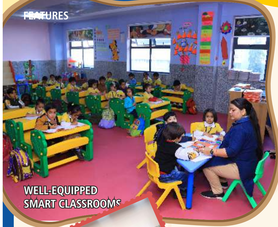
WELL-EQUIPPED SMART CLASSROOMS