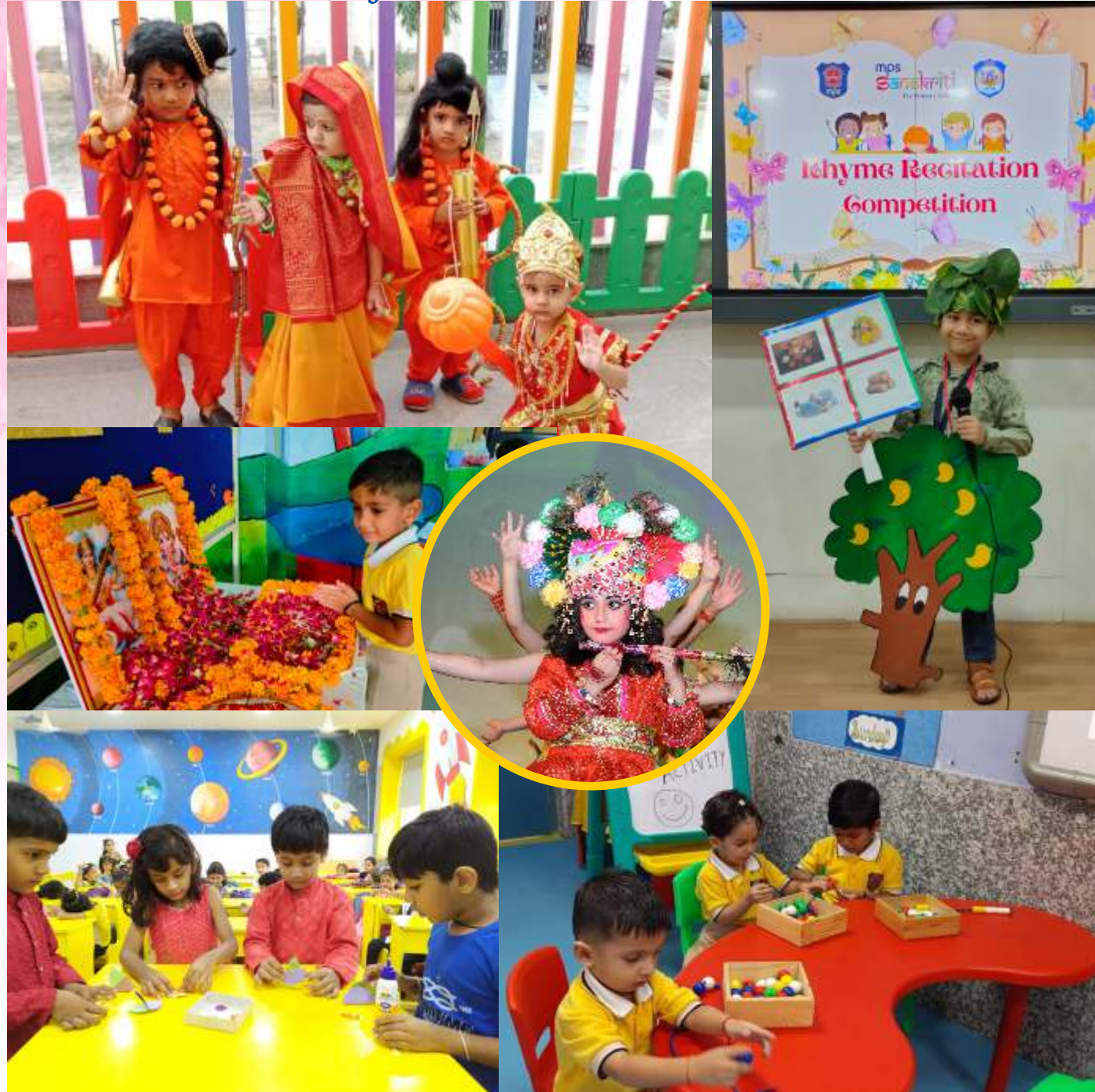
DISCOVERING BEAUTY IN EVERY LEAF AND PETAL