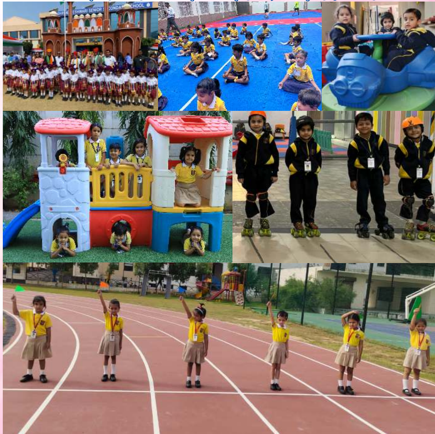
SPORTY SOULS : WHERE EVERY SWEAT DROPS COUNTS