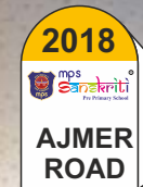
2018 AJMER ROAD