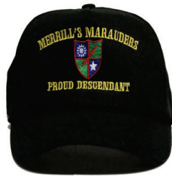
Proud Descendants Trucker's Hats $18.00

THE WAR DIARY OF THE 5307TH Composite Unit Provisional By Capt. John Jones New version of Capt. Jones' Diary, 8X10, Soft cover, 140p. photos, maps and index, ..... $15.00 -All prices include shipping and handling .