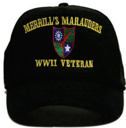
Merrill's Marauders Trucker's Hats $18.00

Obverse Reverse Merrill's Marauders Challenge Coin 2 inches by 0.2 inches, solid nickel $15.00