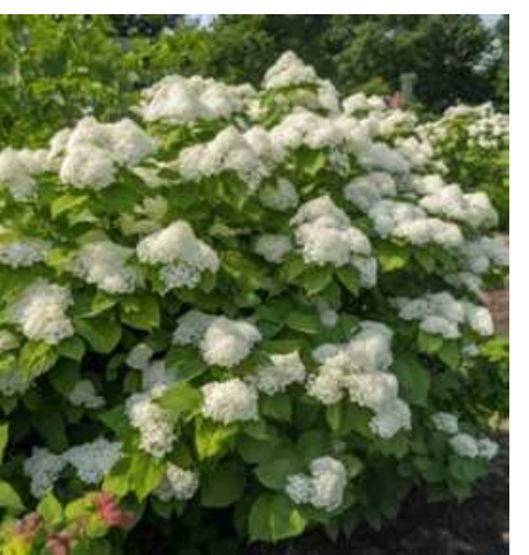
VdC - Viburnum d. 'Chicago Lustre'