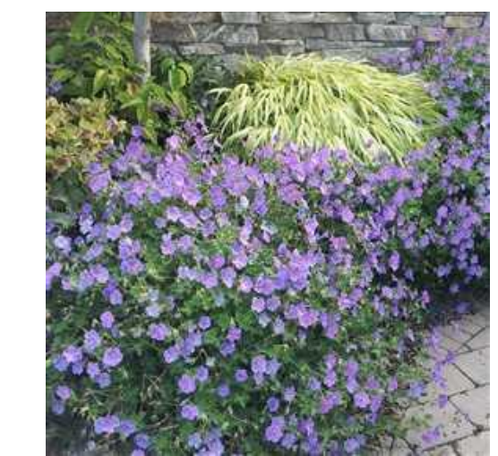
Ger - Geranium x 'Rozanne'