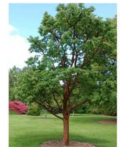
AgS - Acer griseum