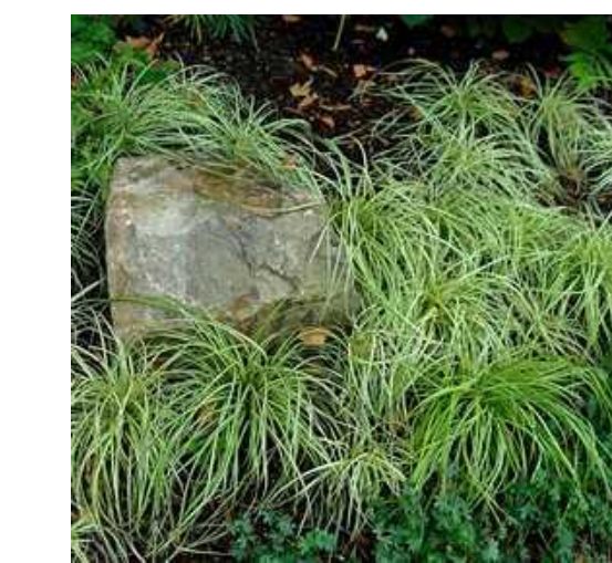
GCo - Grass, Carex o. 'Evergold'