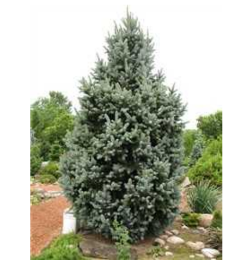
Ppl - Picea p. 'Iseli Fastigiata'