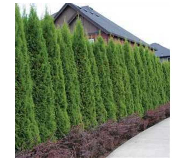
TpN - Thuja p. 'Northern Spire'