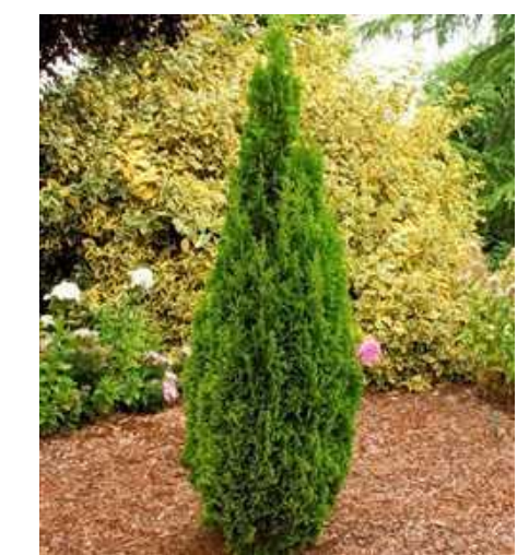
ToD - Thuja o. 'Degroot Spite'