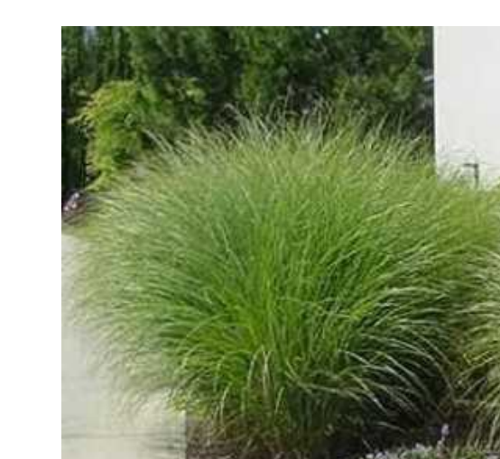
G1s - Miscanthus s. 'Gracillimus'