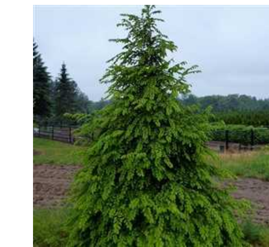
Tc - Tsuga canadensis