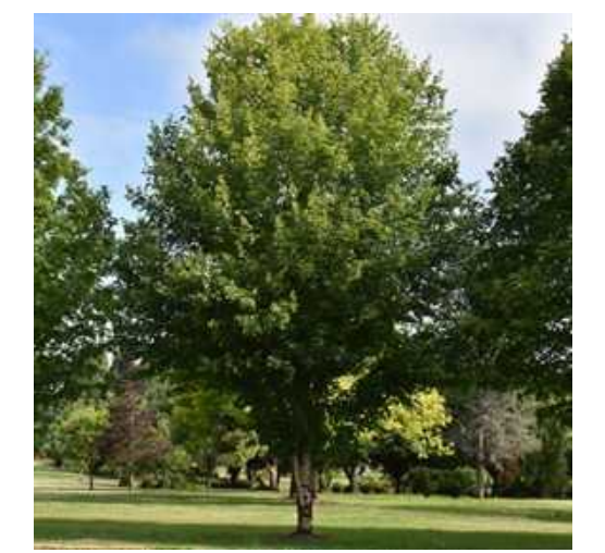
AsB - Acer s. 'Belle Tower'