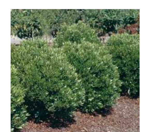
IgS - Ilex g. 'Shamrock'