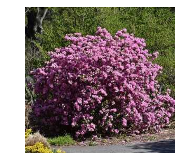
RPE - Rhododendron 'PJM Elite'