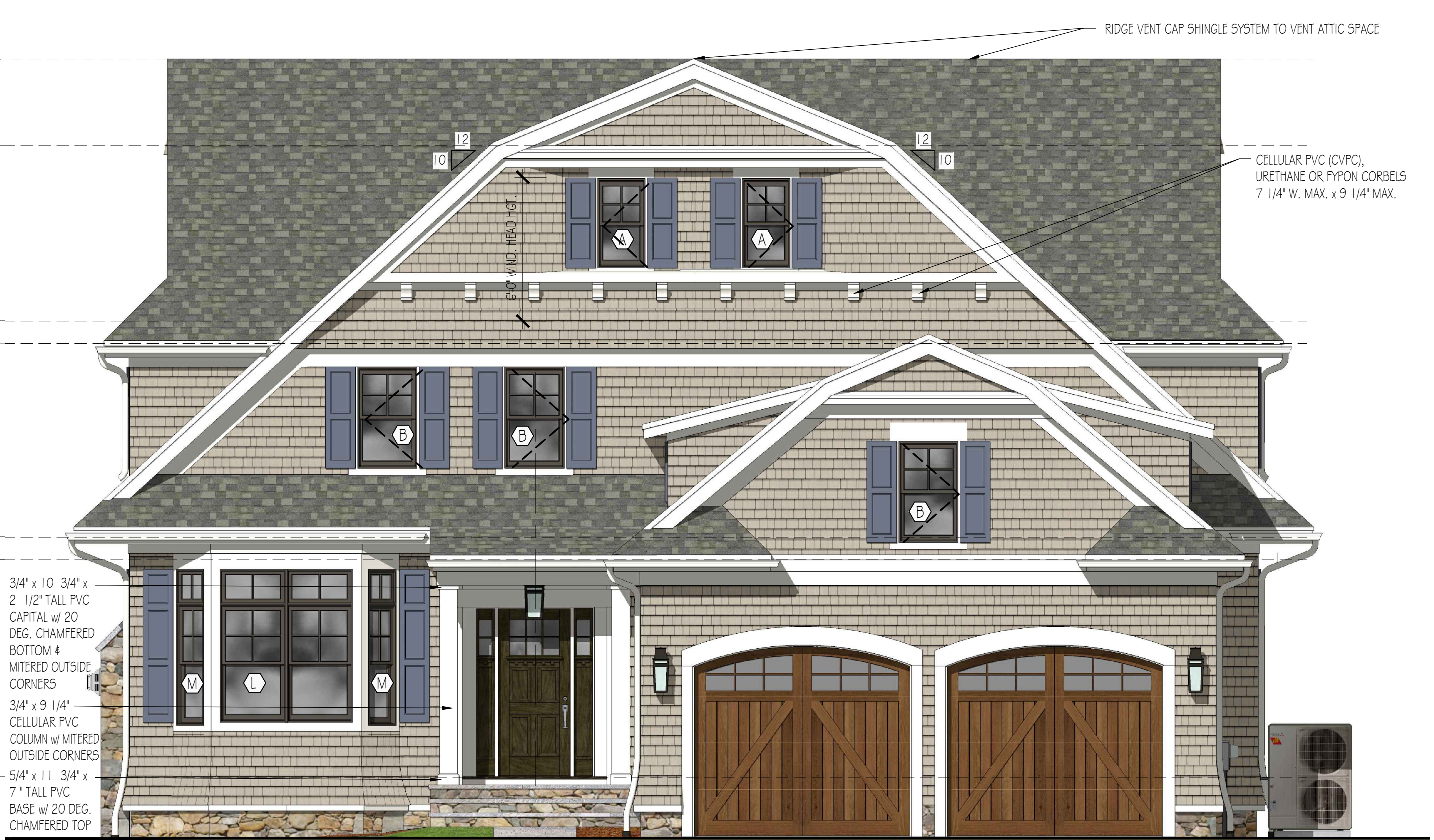
FRONT / EAST / WOODLAND ROAD 2D ELEVATION