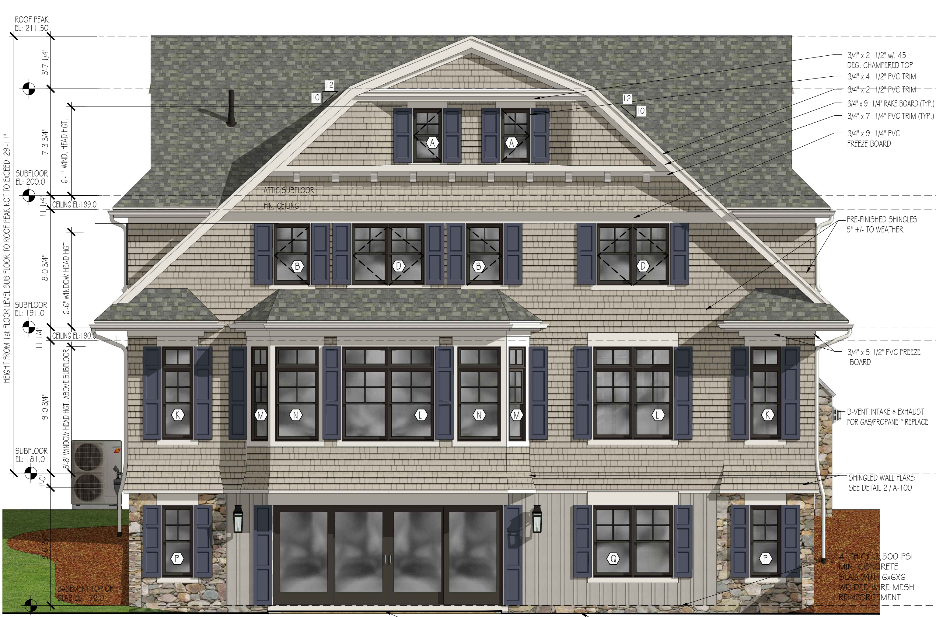
REAR / WEST / PILGRIM PATH 2D ELEVATION