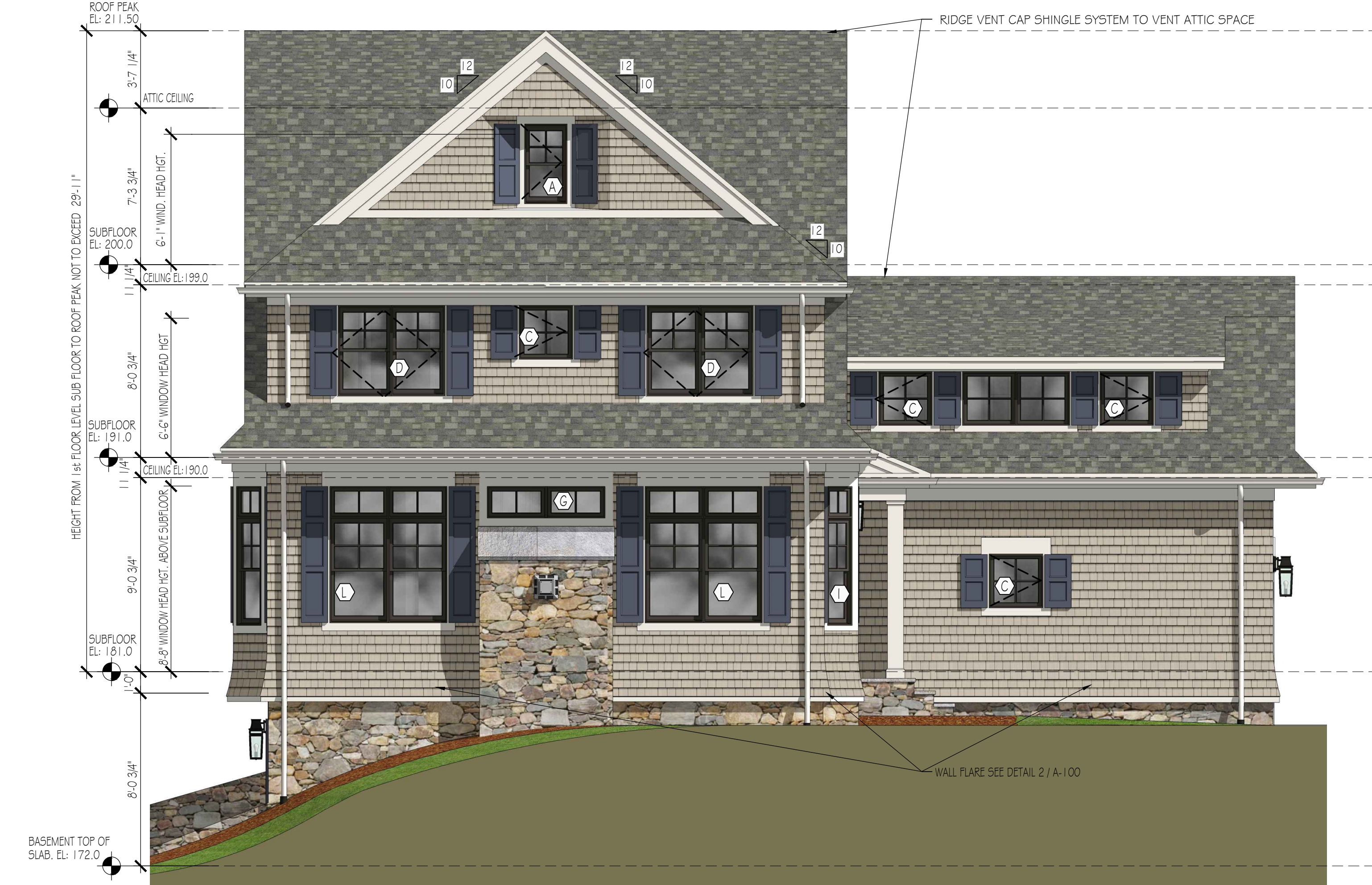
GREAT ROOM SIDE / SOUTH 2D ELEVATION