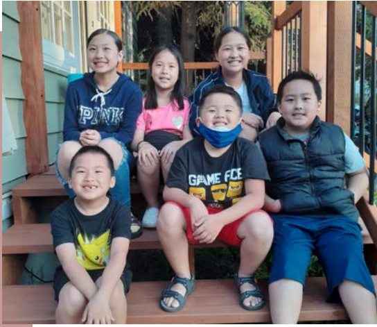
Missing a few, but these are my nieces and nephews <3