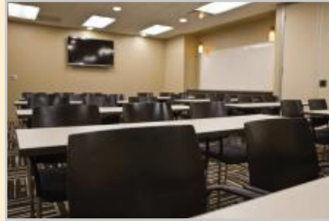
STL/KC Room | 56