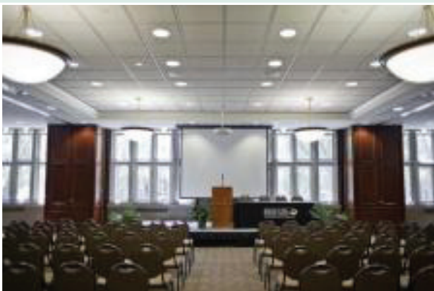
Stotler Lounge | 100-300