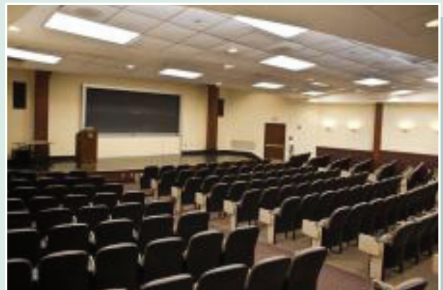
Wrench Auditorium | 222