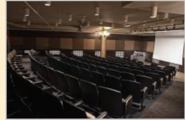
Leadership Auditorium | 120