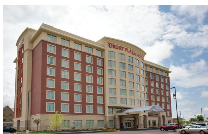
Drury Plaza Hotel Columbia East 3.8 miles from campus