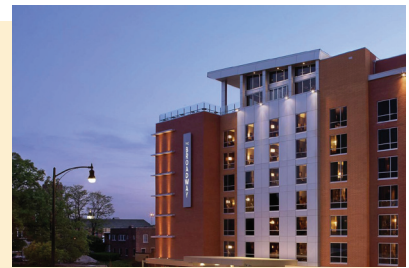
The Broadway Hotel - Doubletree by Hilton 0.6 miles from campus