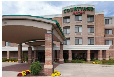
Courtyard by Marriott - Columbia 2.8 miles from campus