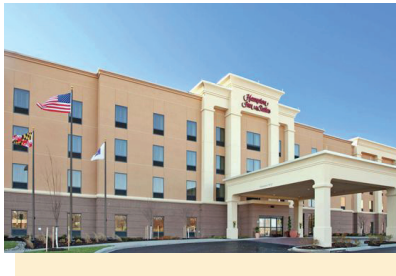
Hampton Inn & Suites Columbia 0.2 miles from campus