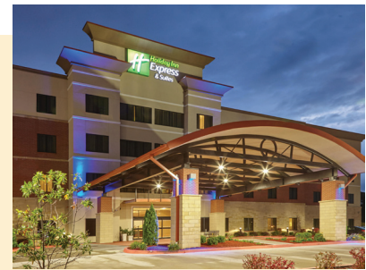
Holiday Inn Executive Center-Columbia Mall 3.1 miles from campus