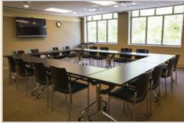
2205A | 32