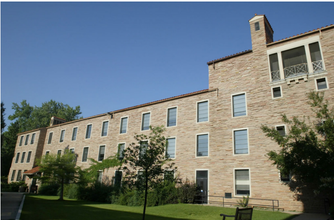
Education (EDUC) 1500 Central Campus Mall Boulder, Colorado 80309