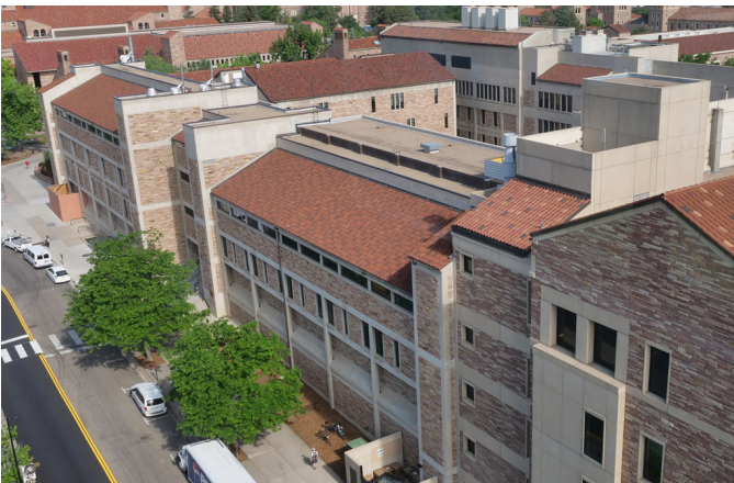
Muenzinger Psychology (MUEN) 1905 Colorado Avenue Boulder, Colorado 80309