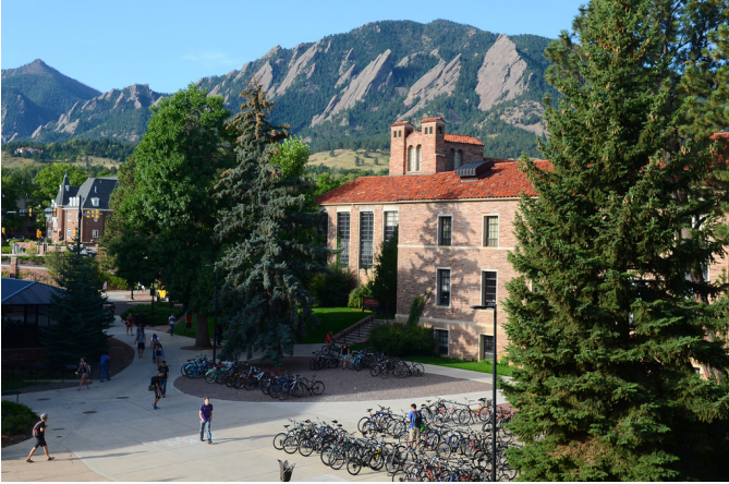
Hellems Arts & Sciences (HLMS) 1550 Central Campus Mall Boulder, Colorado 80309