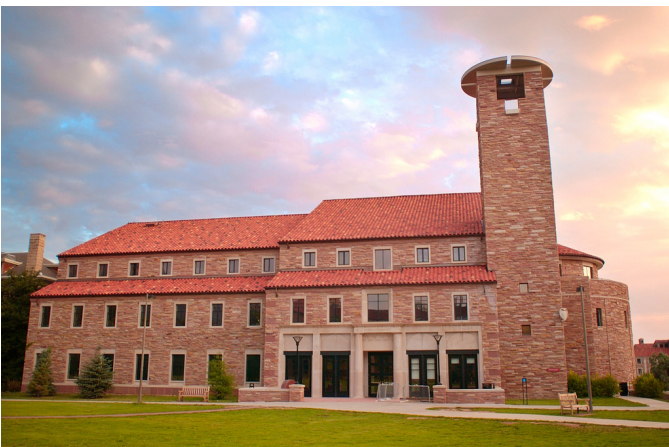
Eaton Humanities (HUMN) 1610 Pleasant Street Boulder, Colorado 80309