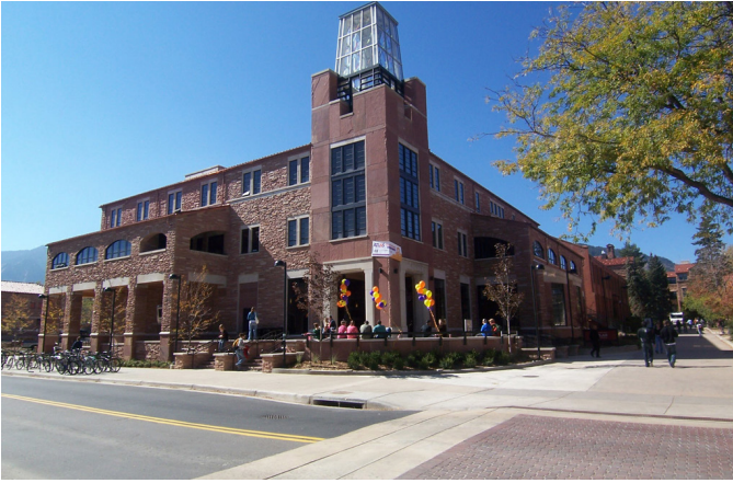
Roser ATLAS Center (ATLS) 1125 18th Street Boulder, Colorado 80309