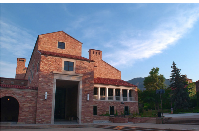
University Memorial Center (UMC) 1669 Euclid Avenue Boulder, Colorado 80309