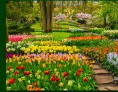
GARDEN OF FLOWERS