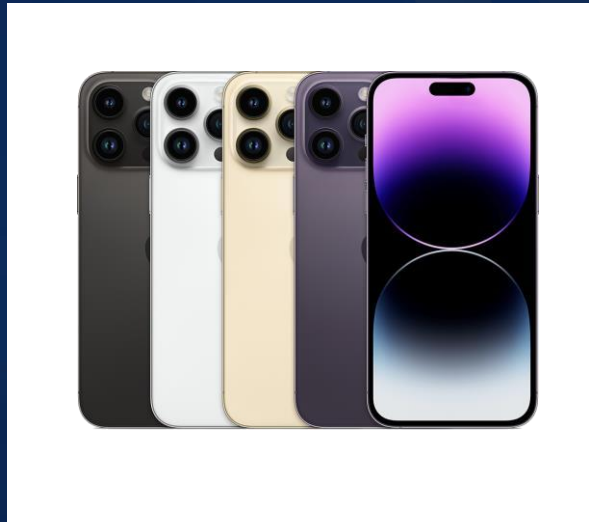
iPhone 14 Pro