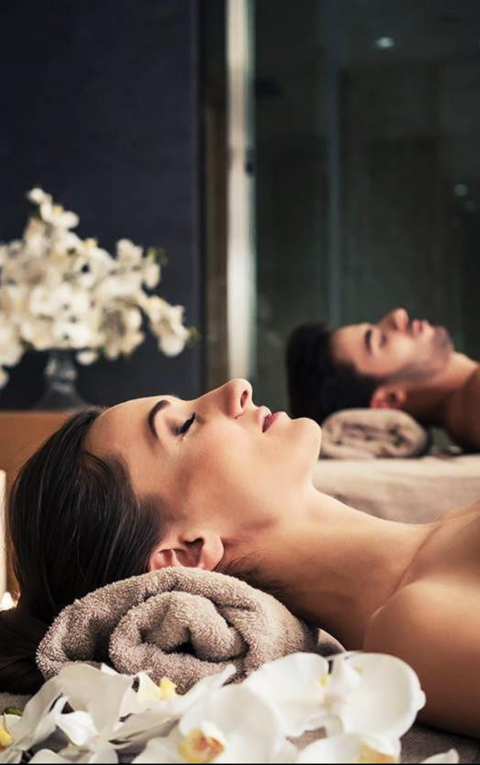
Spa & Sauna