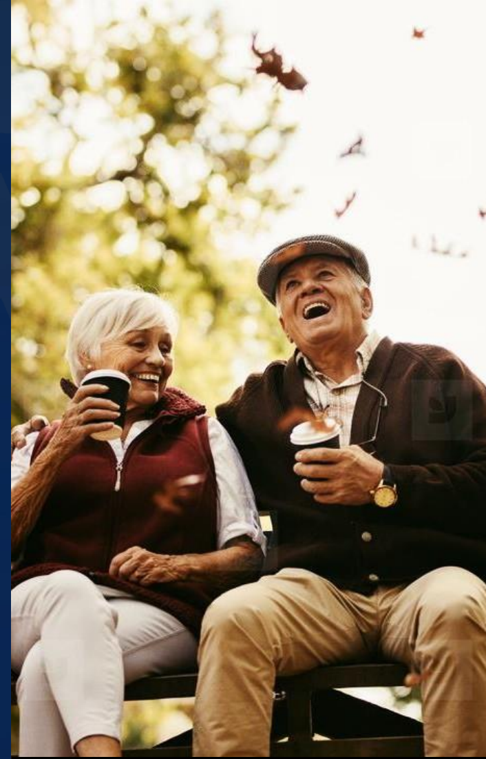
Senior Citizen Zones