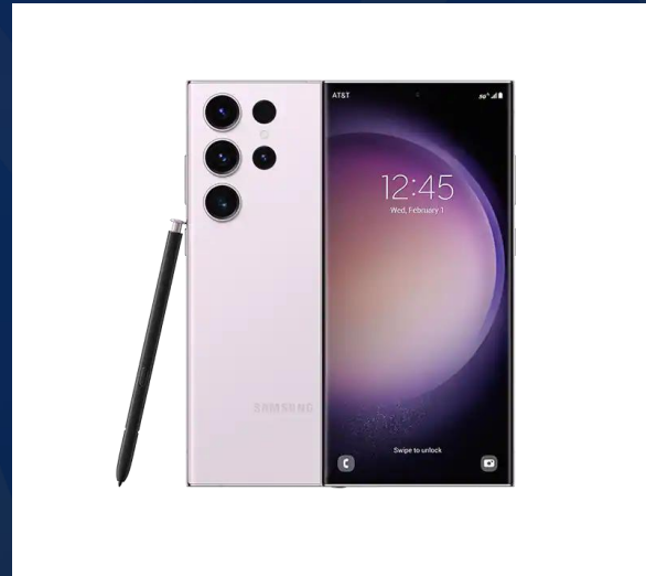
SAMSUNG S23 Ultra