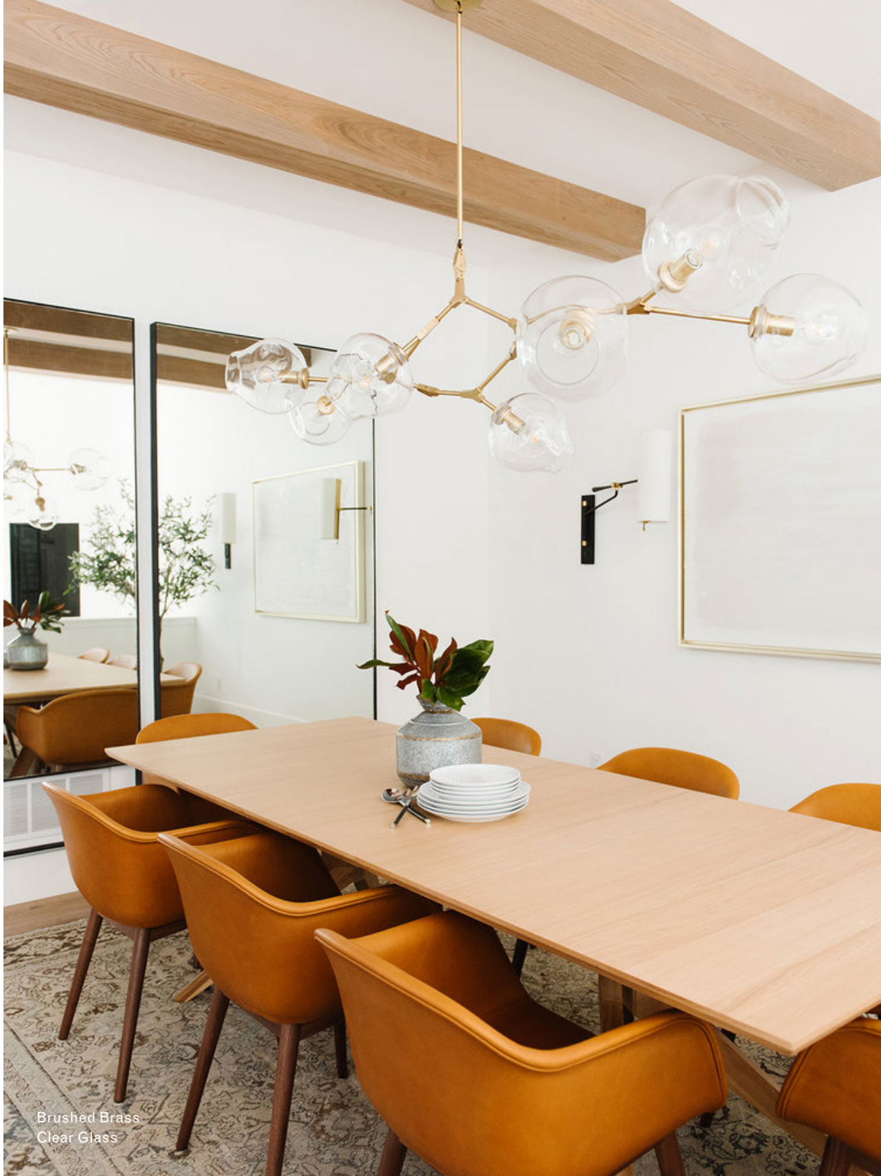
Brushed Brass Clear Glass