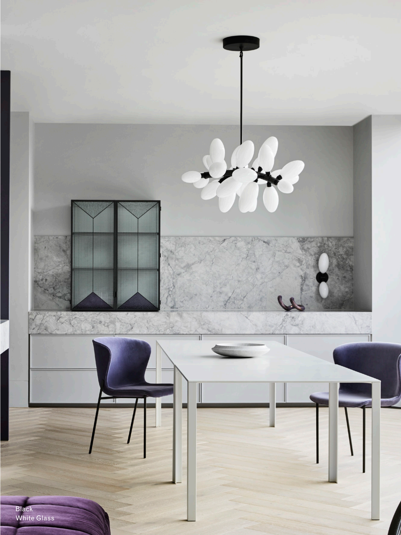
Black White Glass