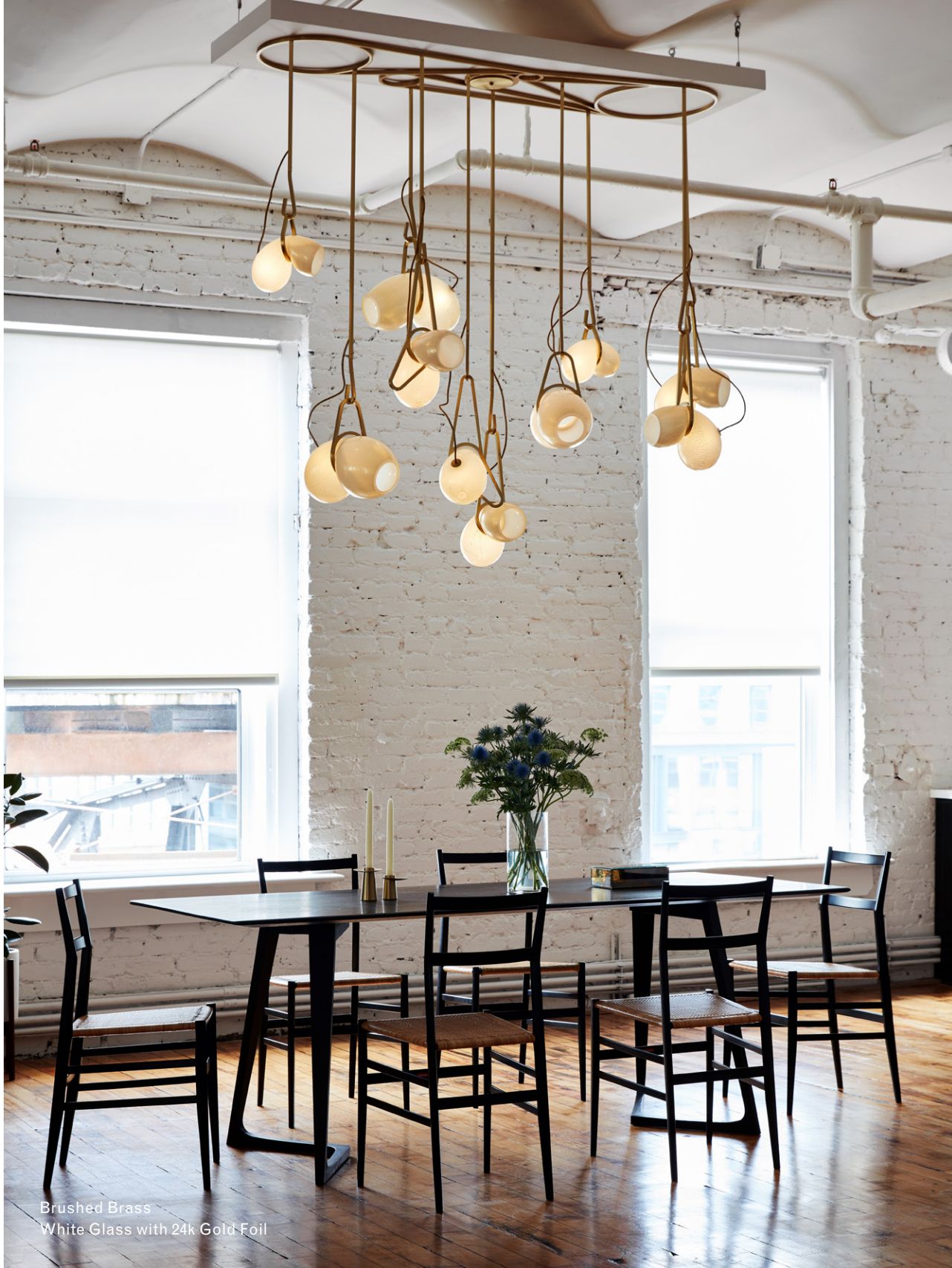
Brushed Brass White Glass with 24k Gold Foil