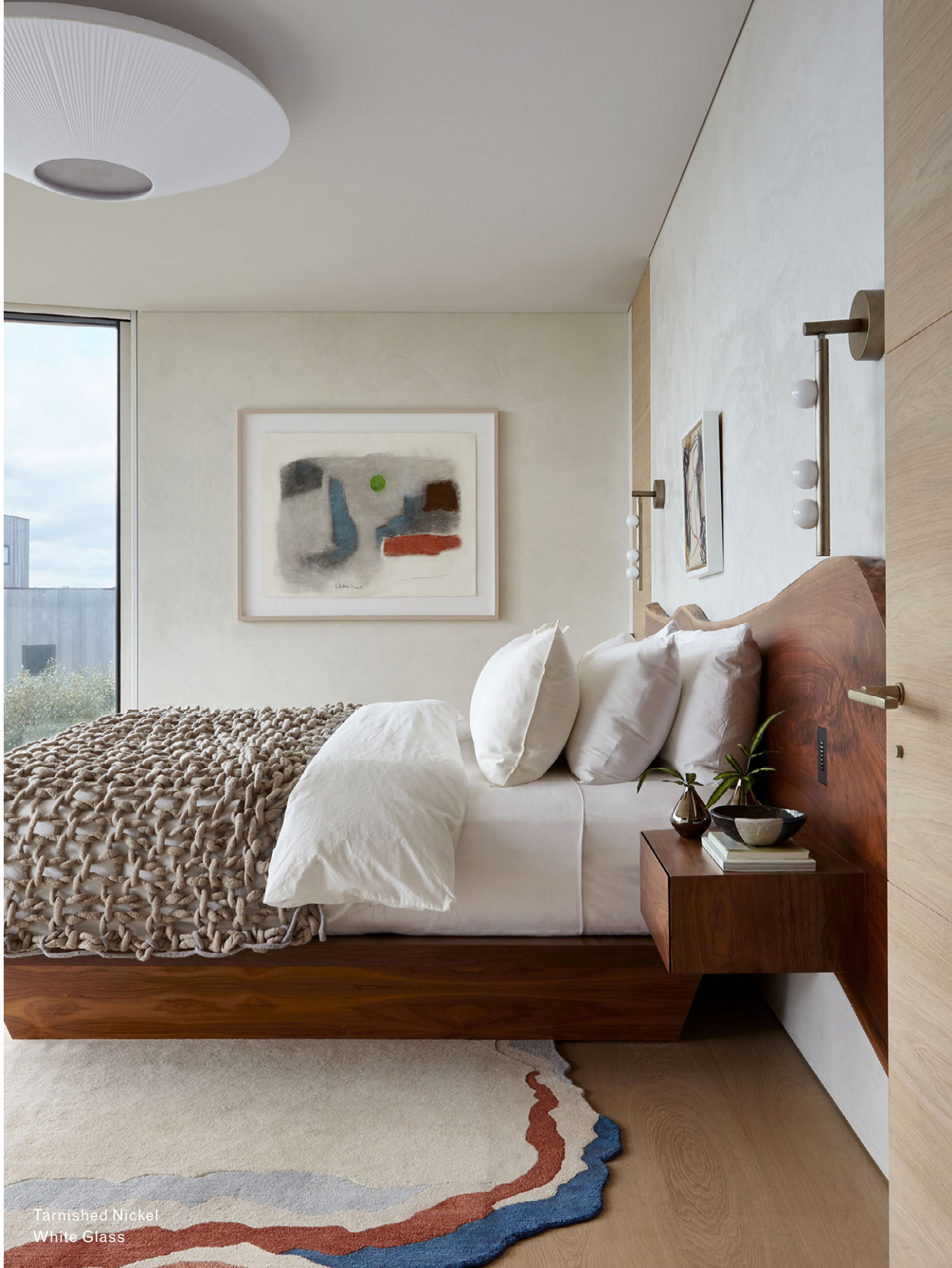
Tarnished Nickel White Glass