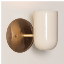
Hammered Bronze Backplate