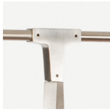
Satin Nickel $1,800 16 weeks

Height: 7in / 17cm Depth: 7in / 17cm Width: 8in / 20cm Weight: 5lb / 3kg Max Wattage: 60w