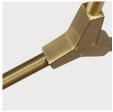
Brushed Brass $1,800 16 weeks