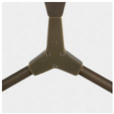
Vintage Brass $1,800 16 weeks

Backplate: 6" x 8" hammered bronze with fixed post Materials: Hammered bronze, machined brass, stoneware Bulbs: E26|110V|5W|2700K LED Globe, Dimmable E27|220V|5W|2700K LED Globe, Dimmable