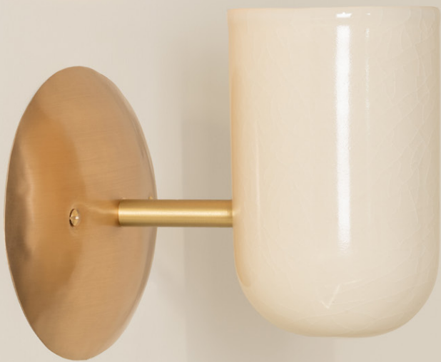
Hammered Bronze Brushed Brass Stoneware Cup