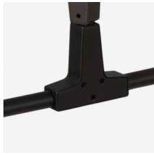
Oil Rubbed Bronze $1,800 16 weeks