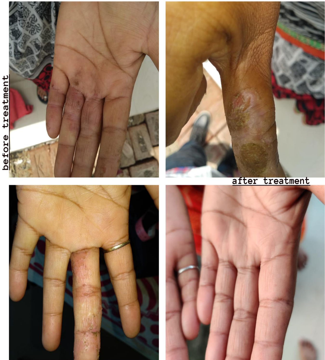
Figure 4: Before & After treatment photographs