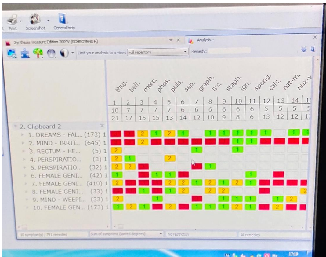
Fig 1. Repertorial Analysis 3

After prescribing two dose per day for three days of Thuja 200, the profuse menses were reduced to normal flow, slight relief in leucorrhoea, relief in haemorrhoids and drastic relief in endometrial polyp.