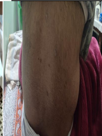
Figure 5- After treatment