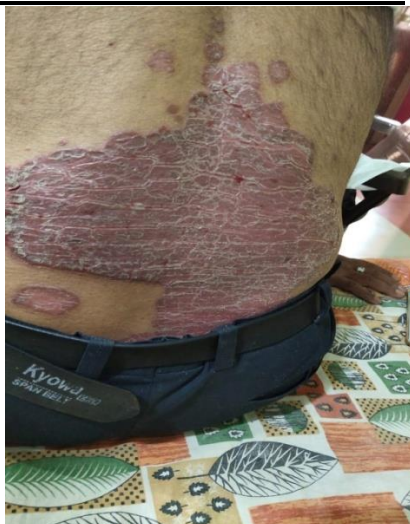
Figure 3-First visit