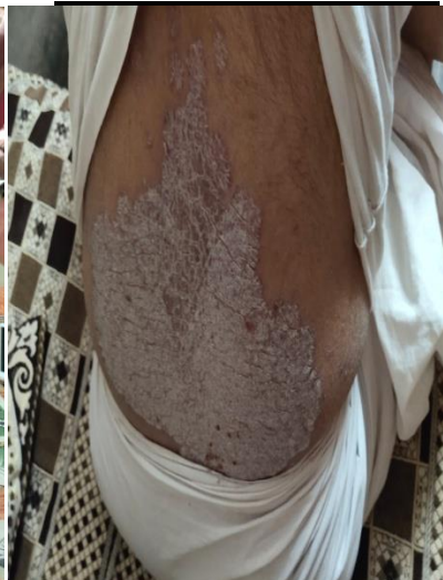
Figure 4- First follow up