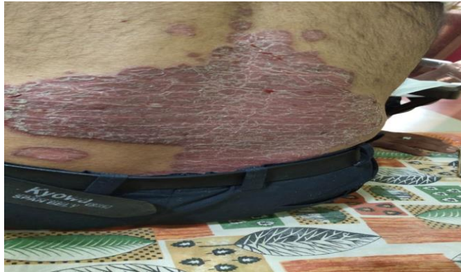
Figure 1- First visit (16/06/2022)

the itching was relieved with some moist application.