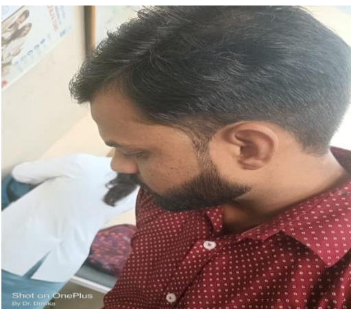
Figure-7-Fifth follow up