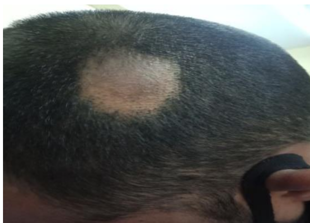
Figure 4-First Visit (21/02/2022)