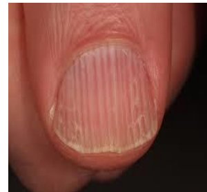
Figure 2 - Nail Appearance in Alopecia Areata [6]