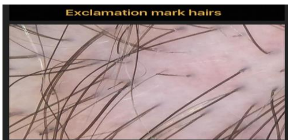
Figure 1 - Exclamation Mark Hairs [5]