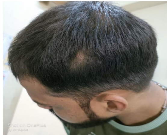
Figure-6-Fourth follow up