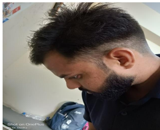
Figure-8-Sixth follow up