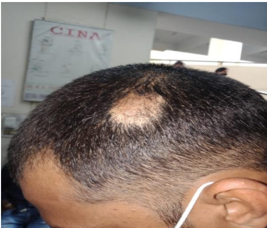
Figure-5-Third follow up