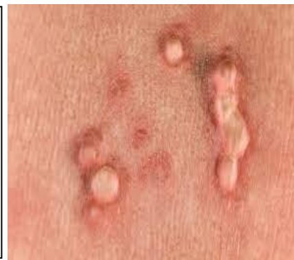
Figure 5-Genital warts

These warts are located mostly in genital areas of male and female patients. They are usually caused due to infection caused by Human papillomavirus and are contracted by unprotected sexual activity or from mother to their feeding offspring. These are present in and around male & female genital, anus, mouth and throat. They may look like small, scattered, skin-colored growth or like a cluster of growths similar to a little bit of cauliflower on your genital. Genital warts differ in appearance from person to person.