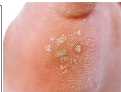
Figure 2-Plantar warts

When warts are present on soles of the feet than they are known as plantar warts. They mostly grow in clusters and are sometimes painful from pressure exerted on walking and standing and this makes them grow into your skin. They may be appearing singly or in cluster. If plantar warts appear in clusters then they are called mosaic warts. As these warts are flat, tough, and thick, it's easy to confuse them with calluses.