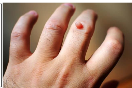
Figure 1-Common warts

Common warts are generally flesh-colored [2] and are small in size of a pinhead to a pea. These are rough or hard growths.