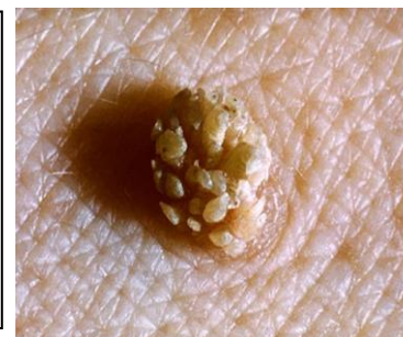
Figure 4-Filiform warts

Filiform warts are fast-growing warts. They appear as thread-like and spiky, sometimes like tiny brushes. Because they tend to grow on the face, around mouth, eyes, and nose.