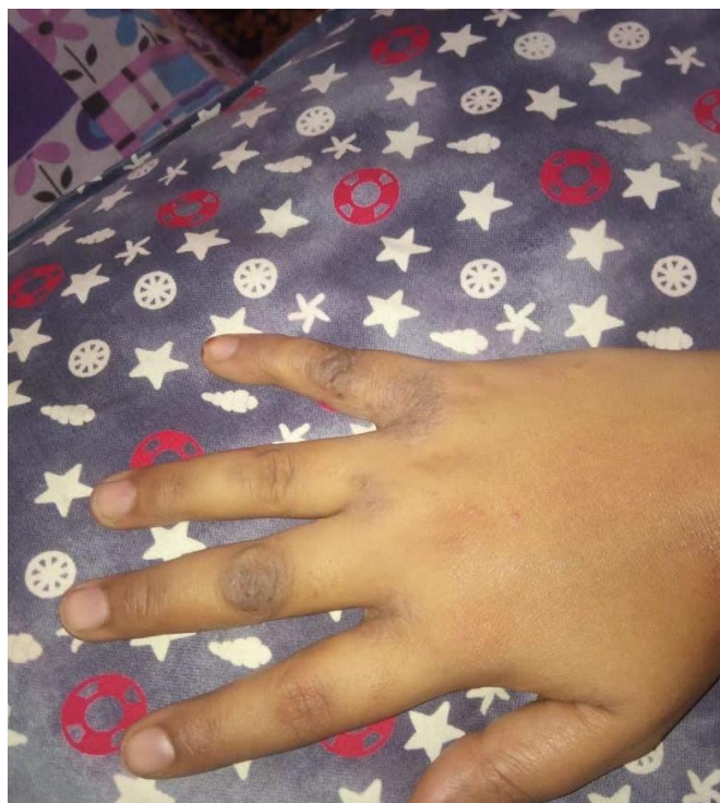
Figure 3- During Treatment

Bi-Annual, Indexed, Double Blind, Peer-Reviewed, Research Scholarly Online Journal in Field of Homoeopathy