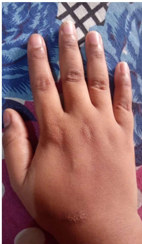
Figure 4- After Treatment

Bi-Annual, Indexed, Double Blind, Peer-Reviewed, Research Scholarly Online Journal in Field of Homoeopathy