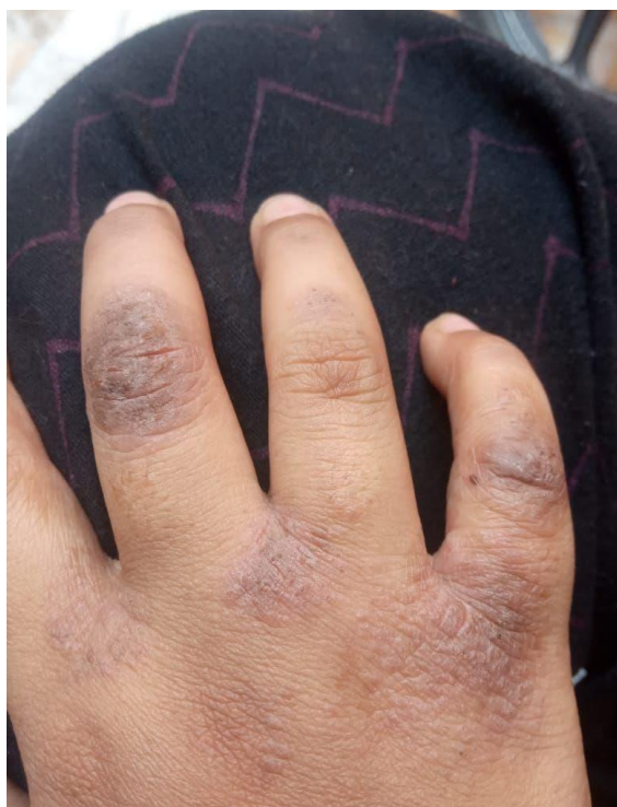
Figure 2- Before treatment

Bi-Annual, Indexed, Double Blind, Peer-Reviewed, Research Scholarly Online Journal in Field of Homoeopathy