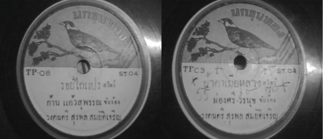
Figure 1: Nok Khunthorng ST02 and 04.

Rian Thai : International Journal of Thai Studies Vol. 7/2014