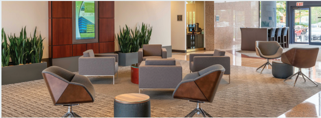
New Lobby Furniture