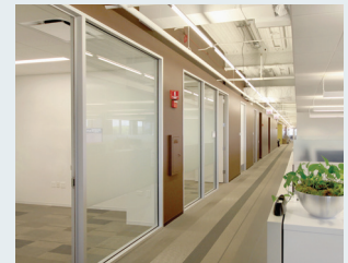
Tenant Office Area