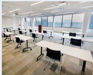
Tenant Training Room