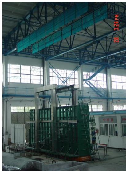
Plate 1: Plate caption (Font 10)

Allow one line between figure/photograph and its caption. The caption should be of font 10. Leave two lines between figure/photograph and text.