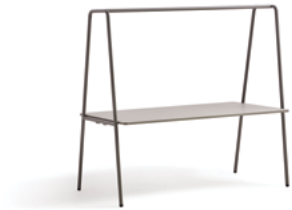
FourReal®A Table Café Height