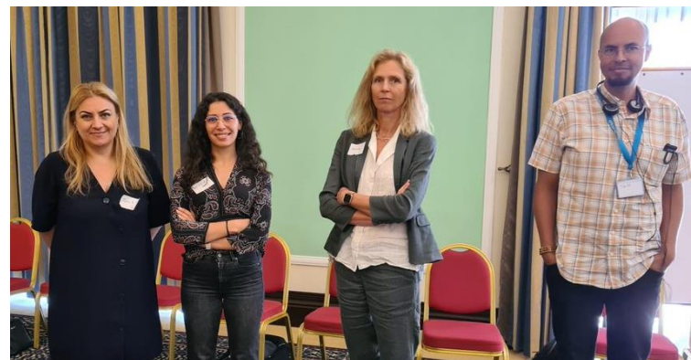
The WEFE Team.