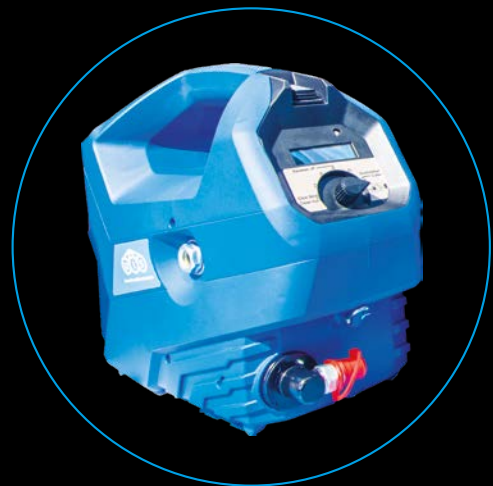
Supplied complete with Hydraulic Power Pack