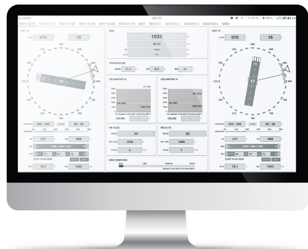
Real-time, unified weather information

Insero AWOS is developed in accordance with EUROCONTROL, EASA, ICAO, and WMO regulations and standards.