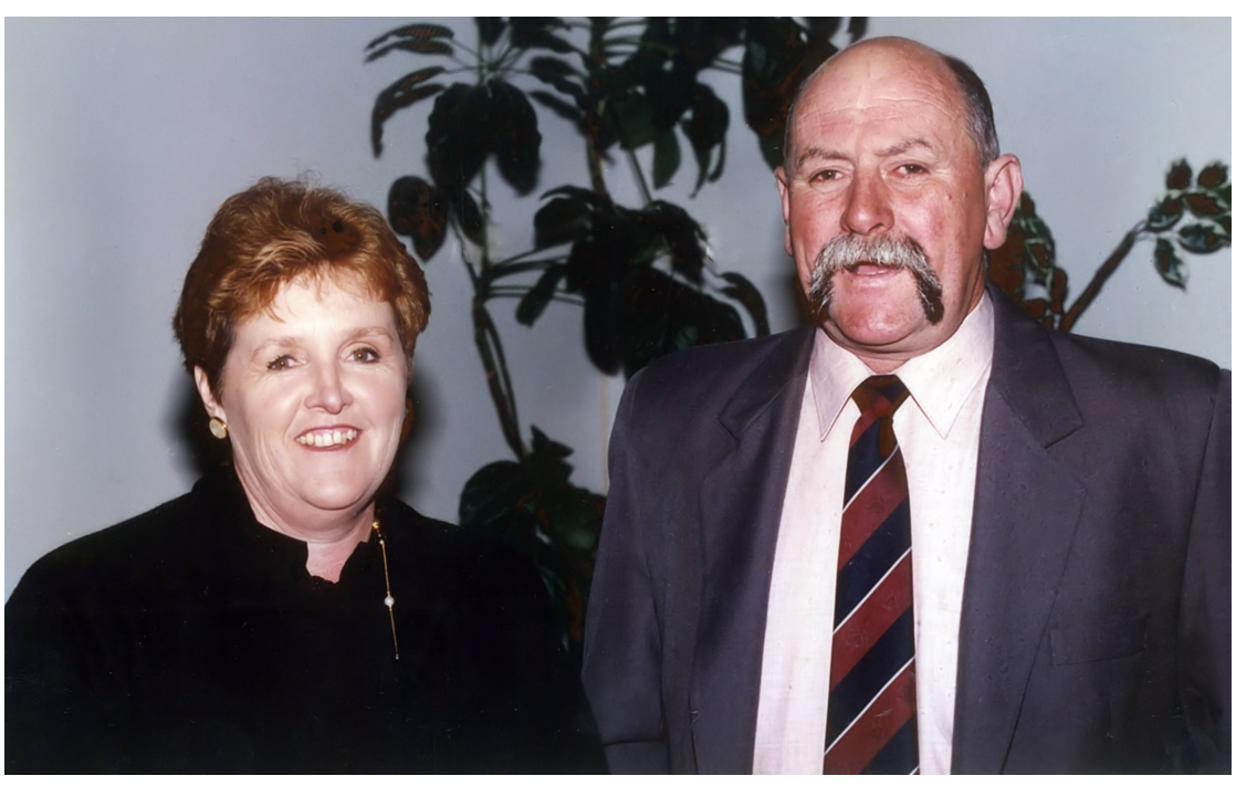
The family would like to thank you for your presence here today, for your kind thoughts, prayers and for your expressions of sympathy and support. The family warmly invite you to share light refreshments at Uralla Golf Club following the service.