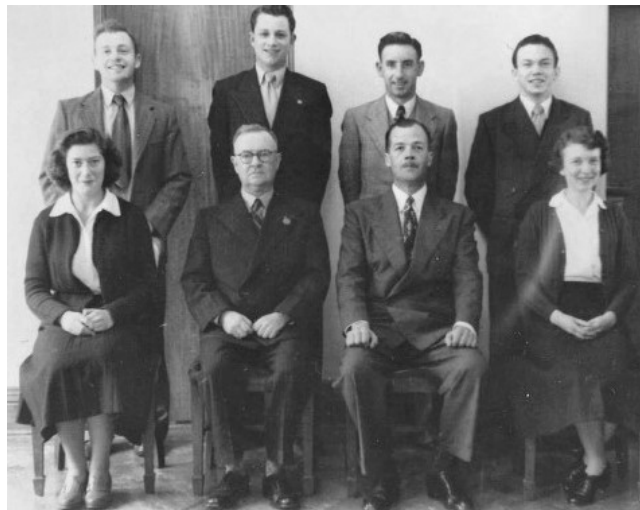
Commonwealth Bank staff Brighton-le-Sands branch, circa 1950

Glory be to the Father, and to the Son, and to the Holy Spirit, as it was in the beginning, is now, and ever shall be, world without end.