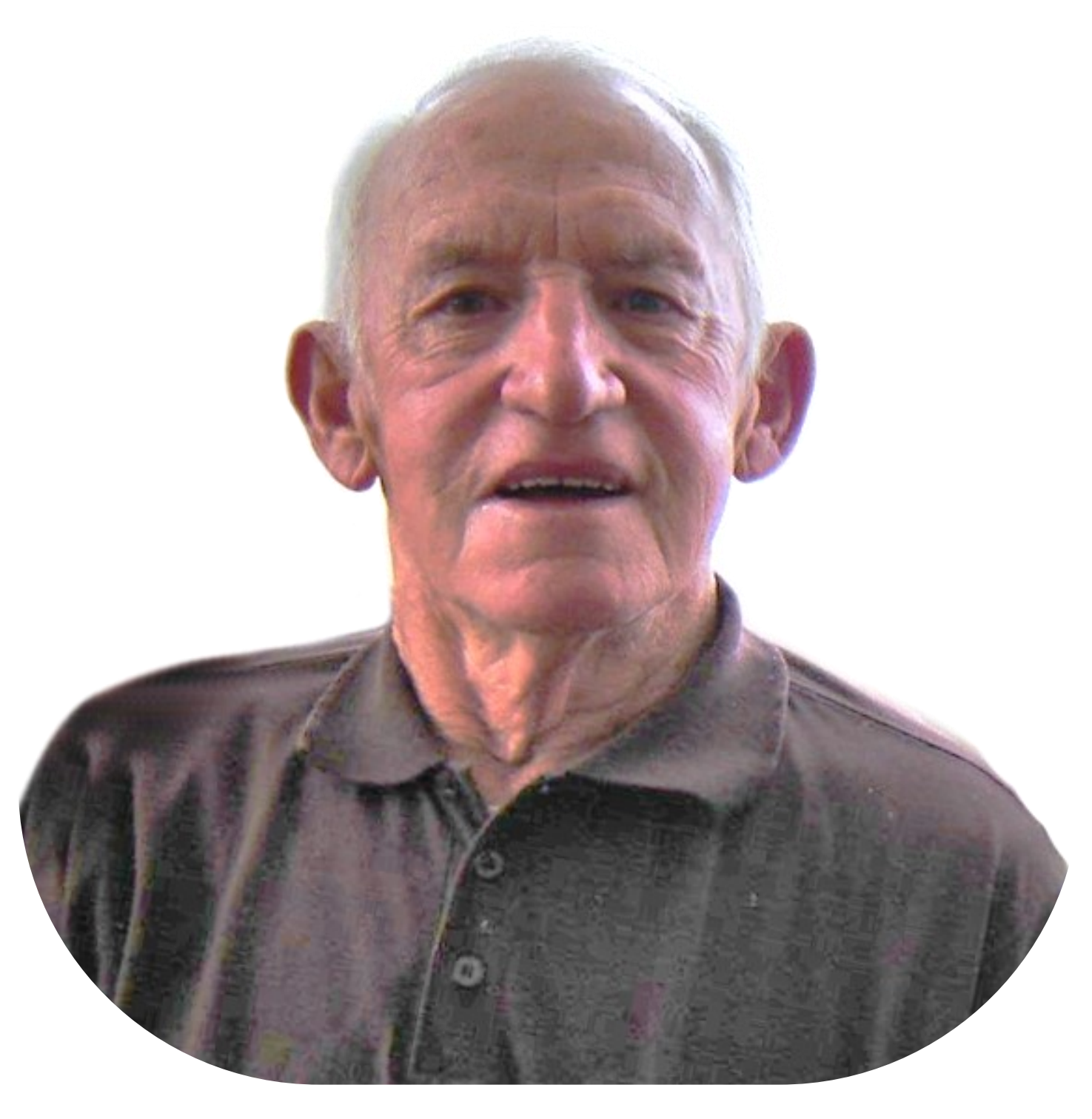
SAINTS MARY AND JOSEPH CATHEDRAL, ARMIDALE 2PM MONDAY, 19TH SEPTEMBER 2022