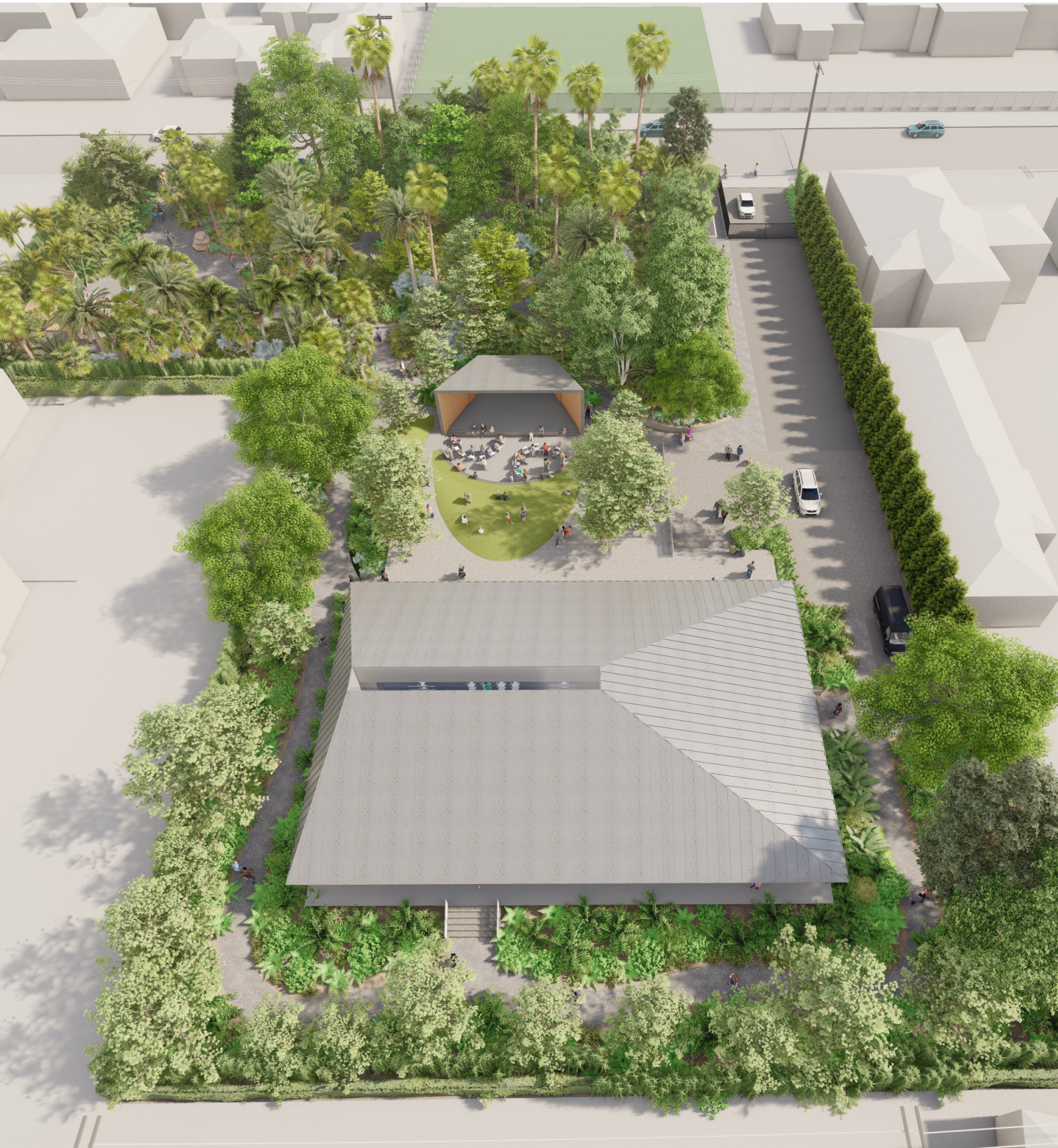
ARTESIA BOTANICAL GARDEN - 02.26.2025