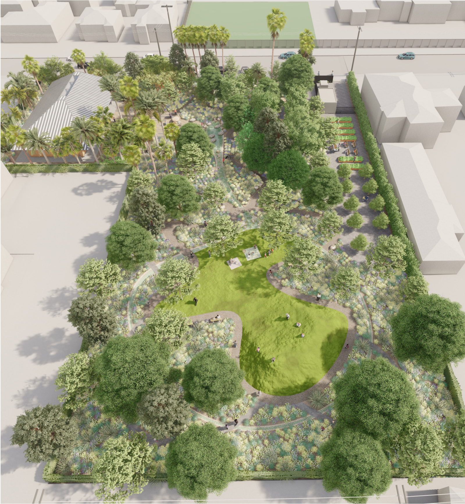
ARTESIA BOTANICAL GARDEN - 02.26.2025