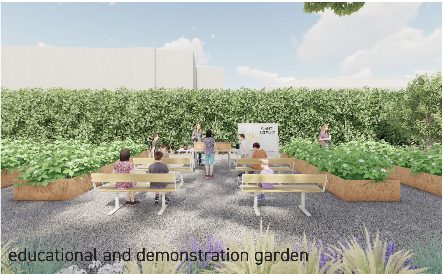
educational and demonstration garden