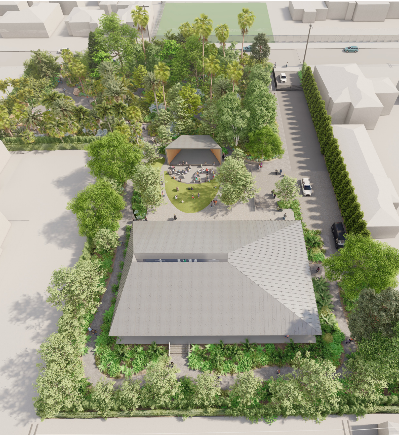
ARTESIA BOTANICAL GARDEN - 02.26.2025