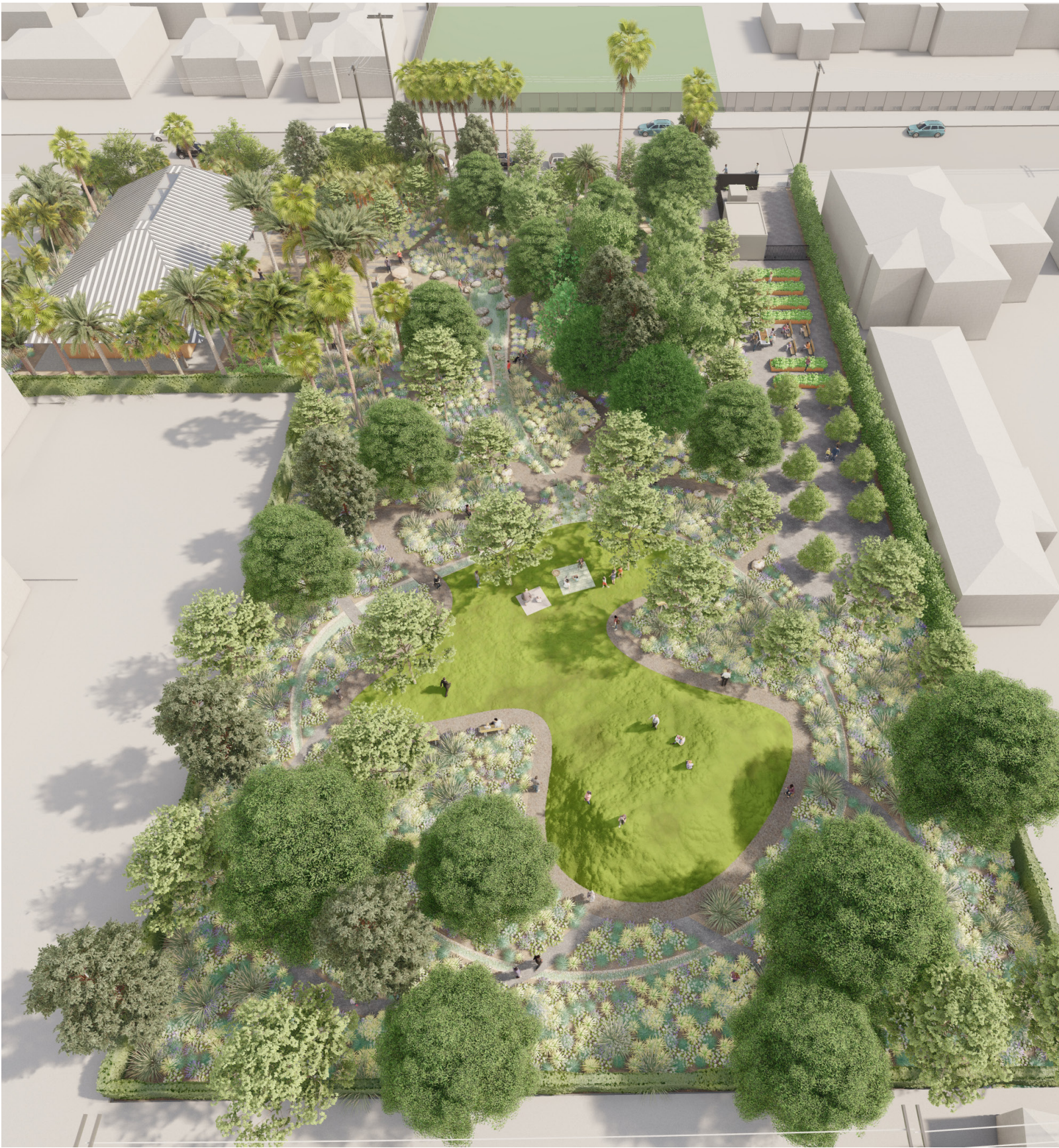
ARTESIA BOTANICAL GARDEN - 02.26.2025