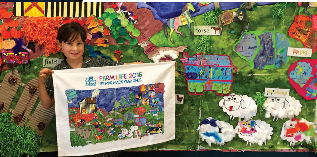
Create your own design