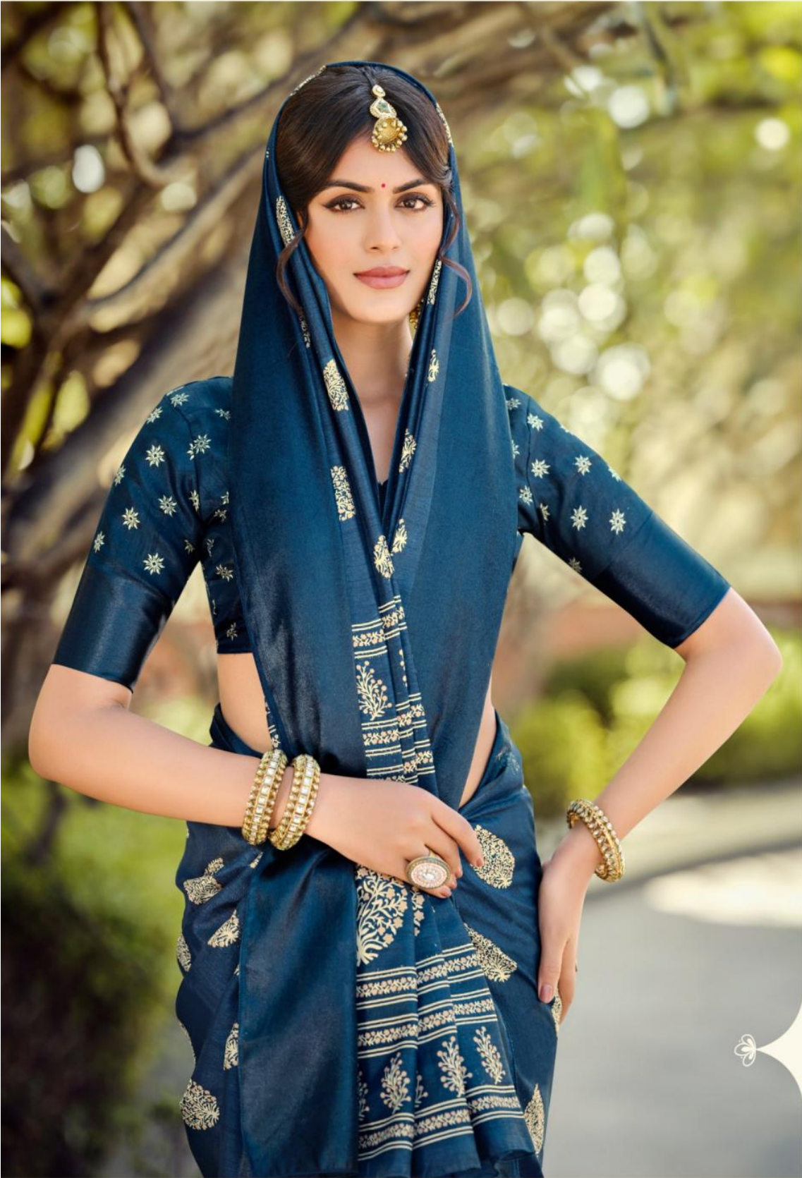
You can find India's rich culture, art and heritage in this long cloth of six yards that get beautifully drapes.